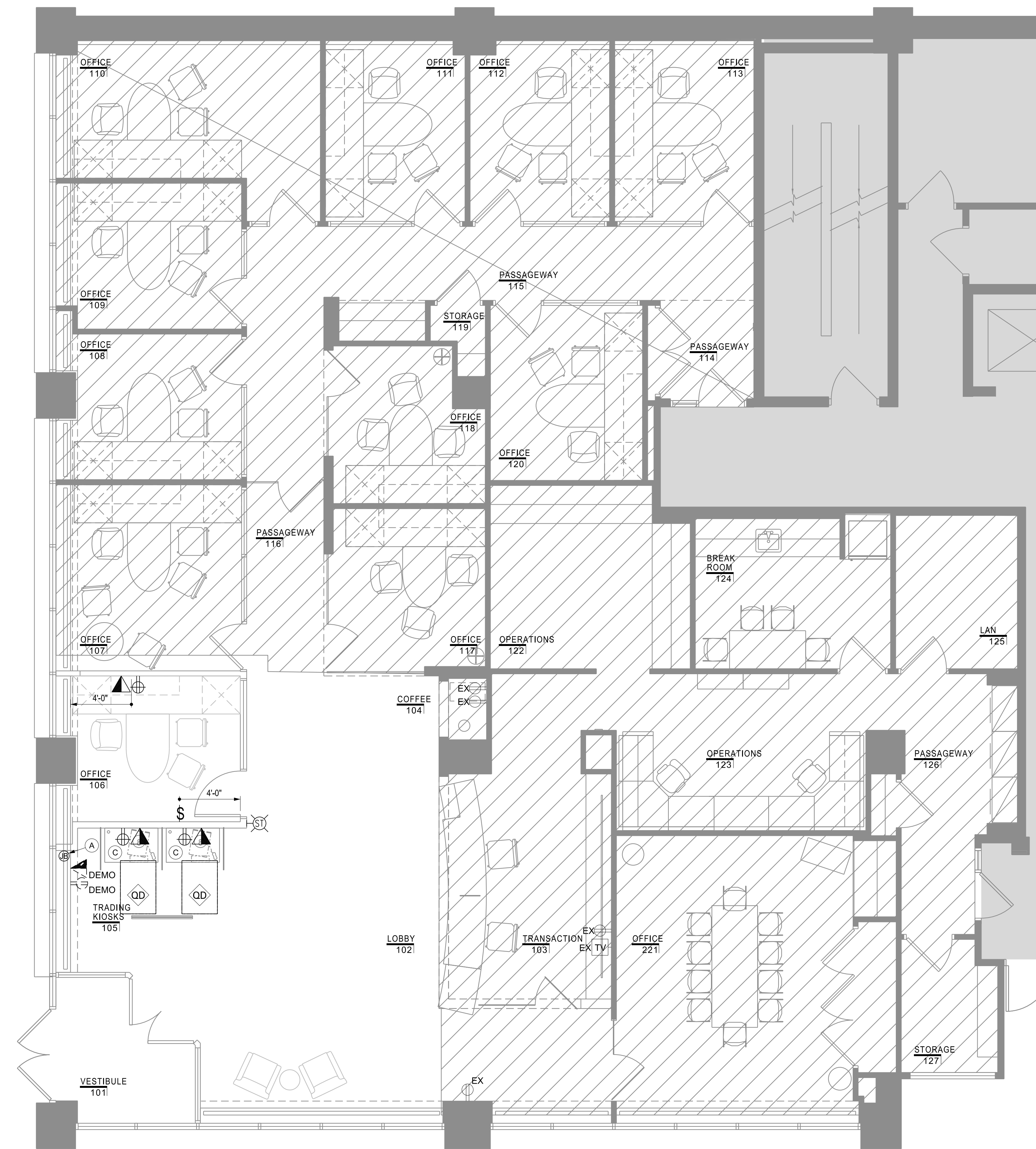
1 POWER & COMMUNICATION LOCATION PLAN ID-301 SCALE: 1/4" = 1'-0"