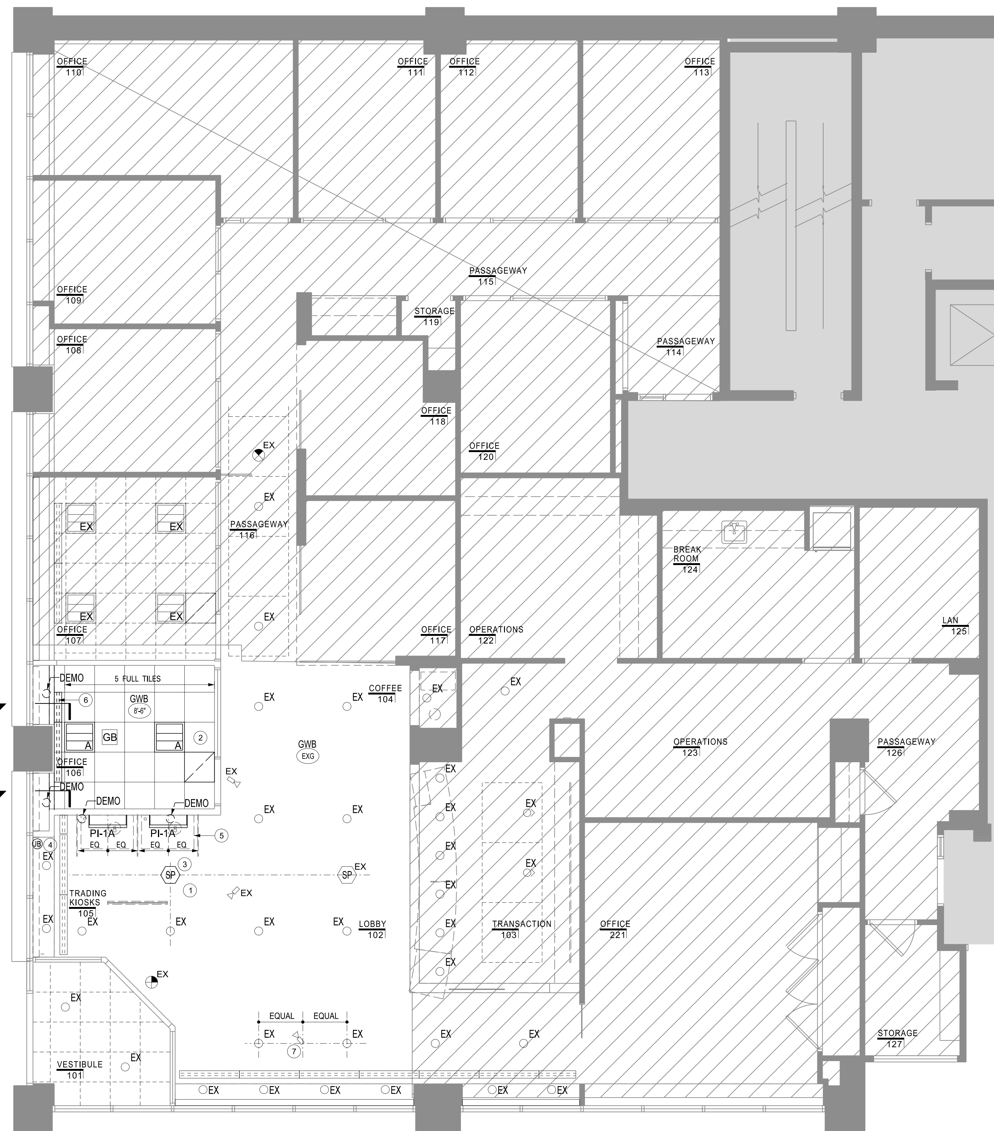
2 REFLECTED CEILING PLAN ID-301 SCALE: 1/4" = 1'-0"