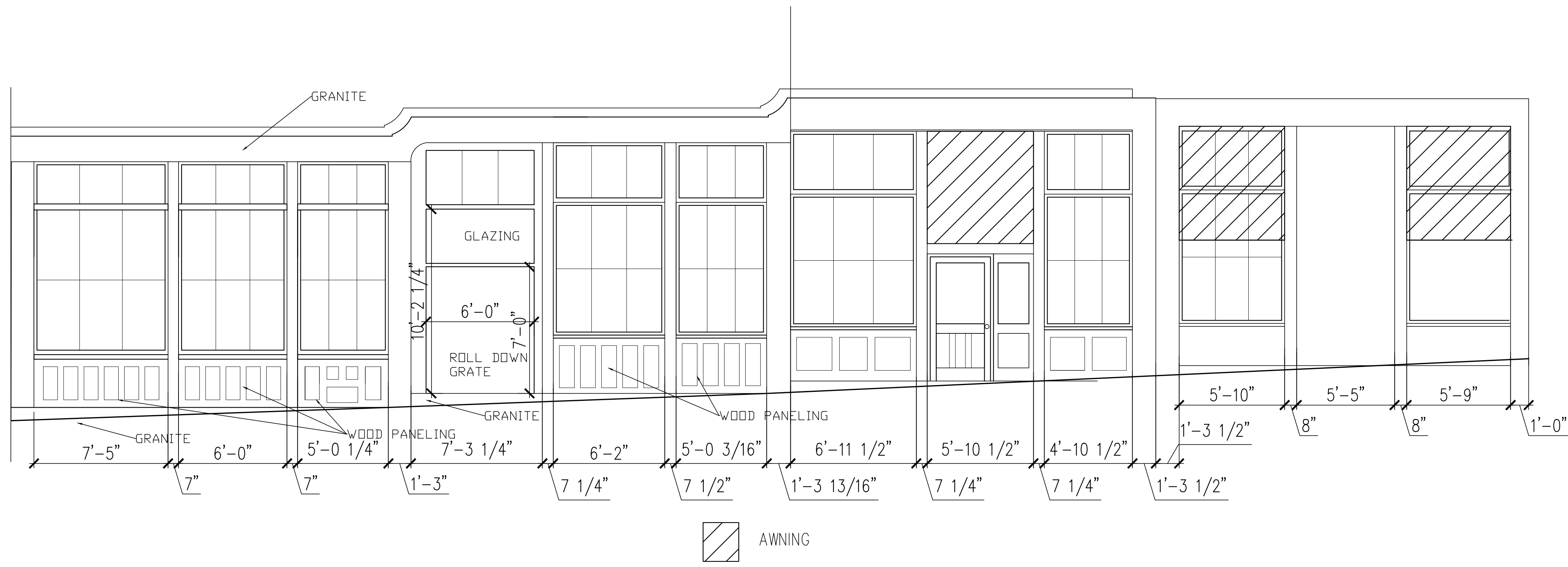
1 | 10 EXCHANGE STREET EXISTING ELEVATION SCALE: 1/4"=1'-0"