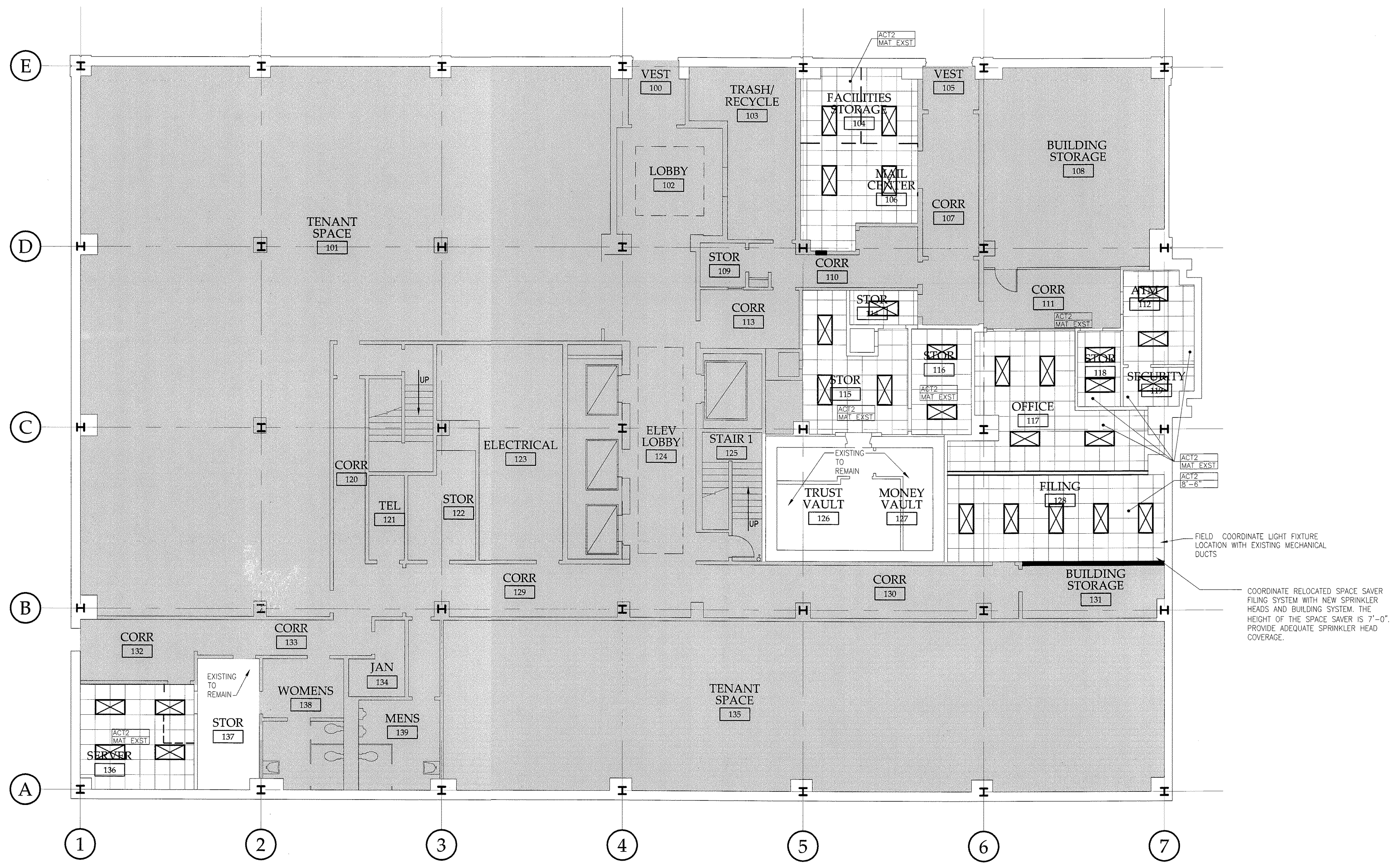
A1 REFLECTED CEILING PLAN 1/8"=1'-0" FIRST FLOOR

© COPYRIGHT 1985-2006 REPRODUCTION OR USE OF THIS DOCUMENT WITHOUT WRITTEN PERMISSION OF GAWRON TURGEON ARCHITECTS IS PROHIBITED