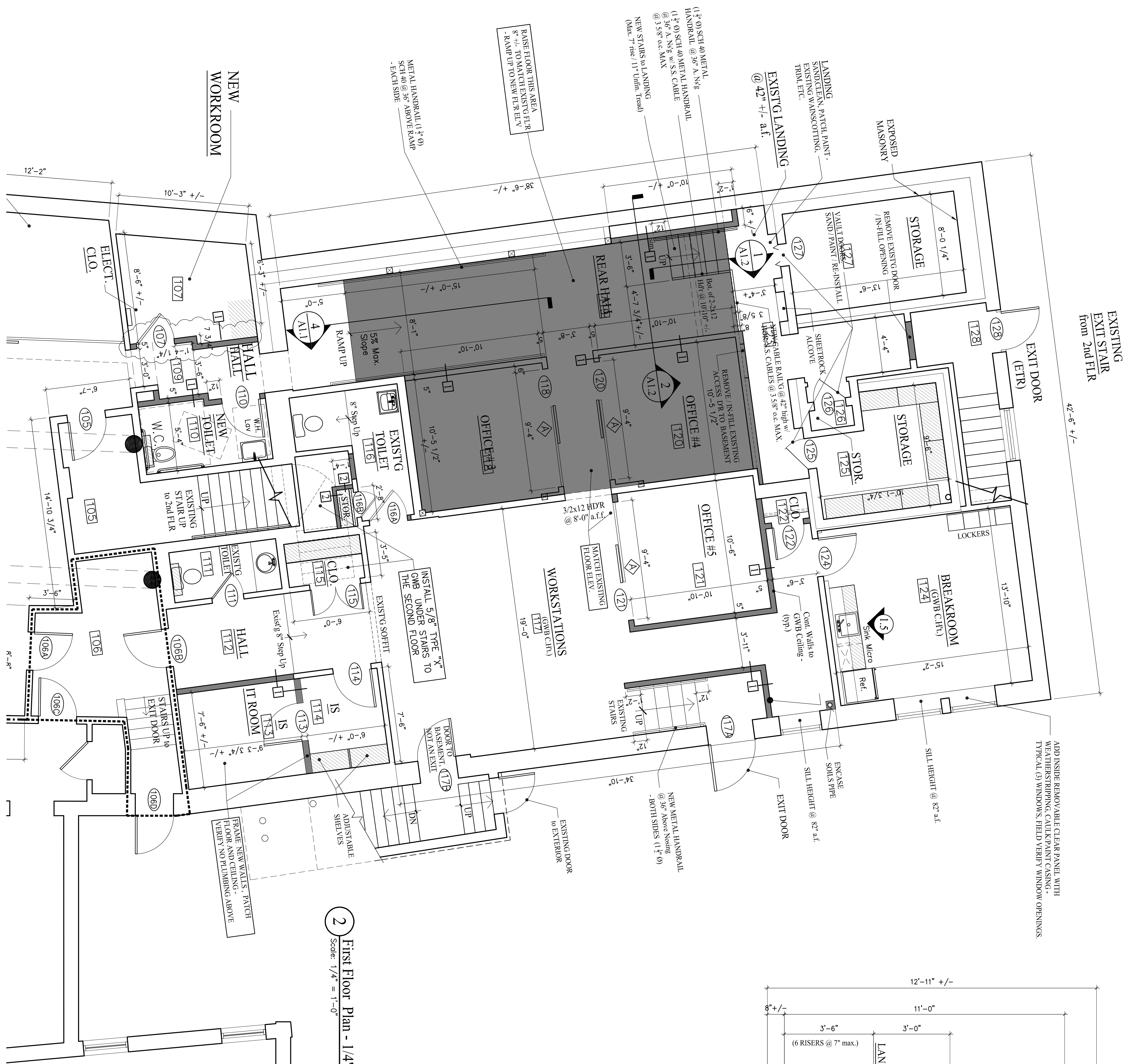
2 First Floor Plan - 1/4" Scale: 1/4" = 1'-0"