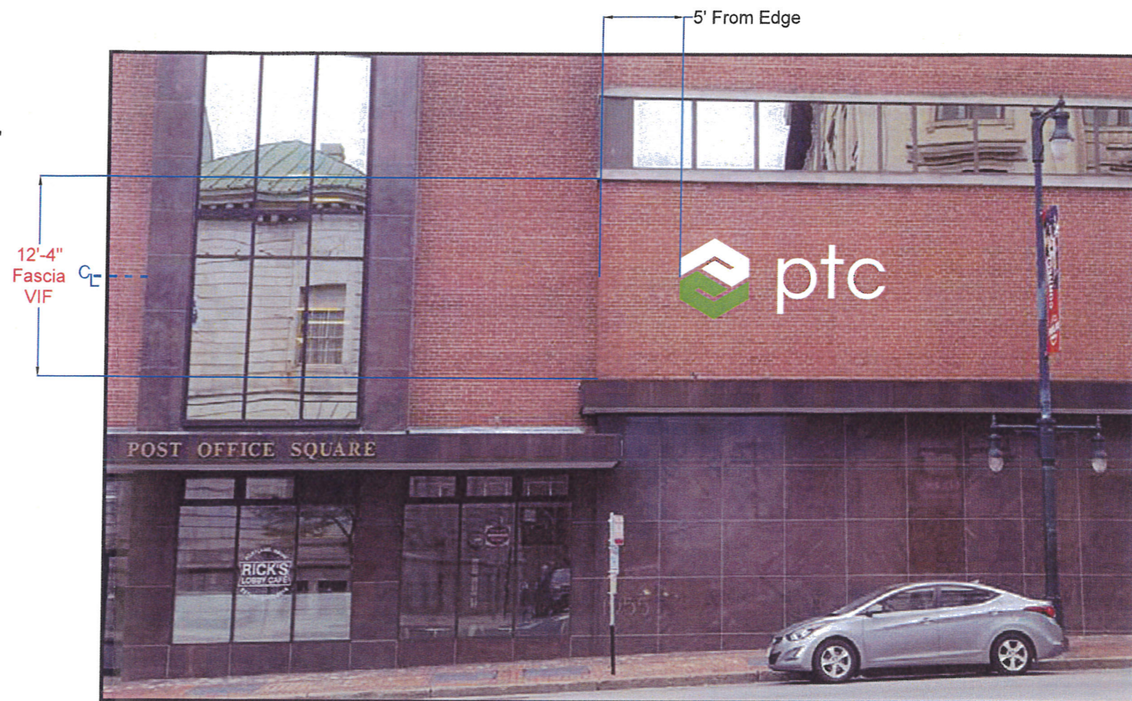
PE Photo Elevation View (Proposed)

Job: PTC Location: 400 Congress St., Portland, ME Account Manager: Rich Goins File: PTC PortlandME congress halo lc.plt Date: 06.08.17 D.75 Designer: Pete Rivera Revisions: 06.15.17 D.25 07.19.17 D1.5