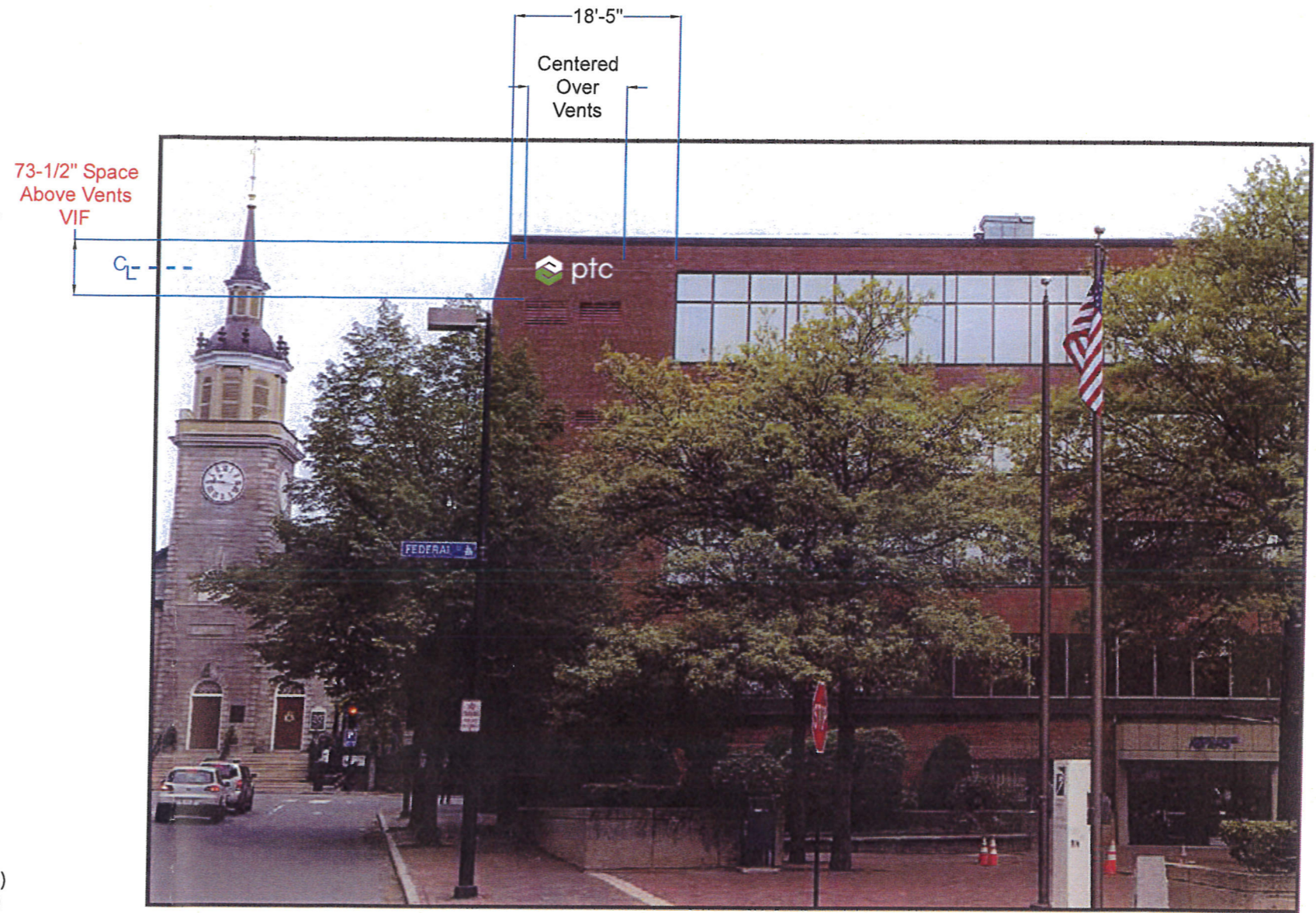
PE Photo Elevation View (Proposed)

Installation: * By ViewPoint * Note: Power by Others * This sign is intended to be installed in accordance with the requirements of Article 600 of the National Electrical Code (NEC) and/or other applicable Local Electrical Codes (LEC). This includes proper grounding and bonding of the sign.