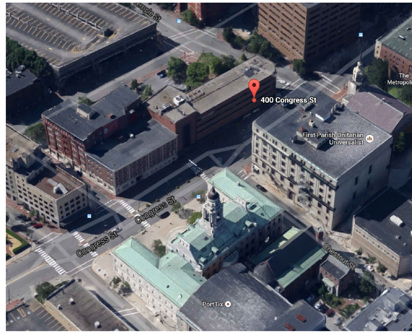
Google Earth Image