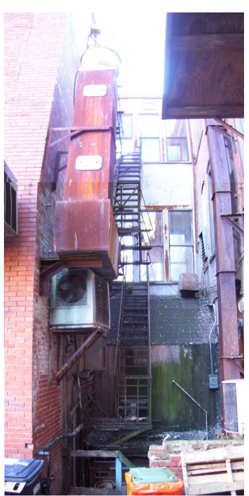
Figures 3 and 4: The "strip" area between the buildings at 46 Market and 31 Exchange Streets, including the second & third floor walkways providing access to 46 Market

The applicant has submitted application materials in accordance with the site plan and subdivision requirements of the city's land use ordinance. Where these materials are insufficient or incomplete, they have been discussed below. It should be noted that the submittal of a revised subdivision plat meeting the city's plat requirements is included as a condition of approval. Prior to signing, the applicant will need to modify