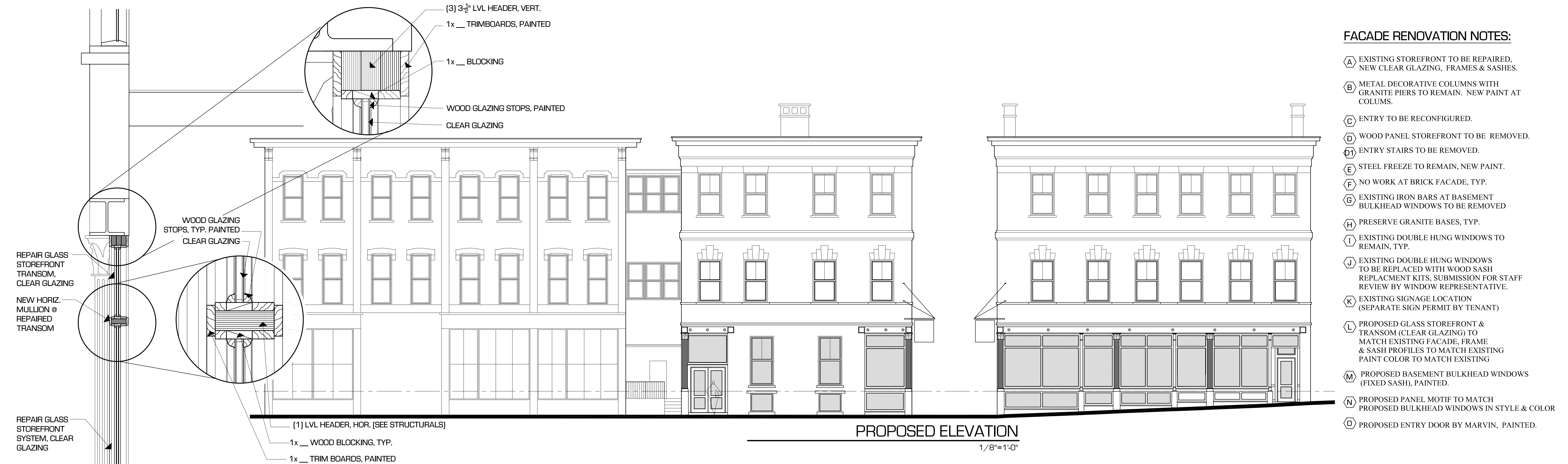
PROPOSED ELEVATION 1/8"=1'-0"