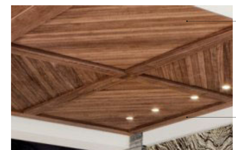
3 CEILING DETAIL A 1 1/2"=1'-0"

24" X 24" #2 COMMON MAHOGANY WOOD PANEL WITH 1" REVEAL. MATTE STAIN TO MATCH DESIGNER SAMPLE. QUARTER SAWN PLANKS. 1 1/2" HARDWOOD BATONS, FINISH STAINED TO MATCH DESIGNER SAMPLE.