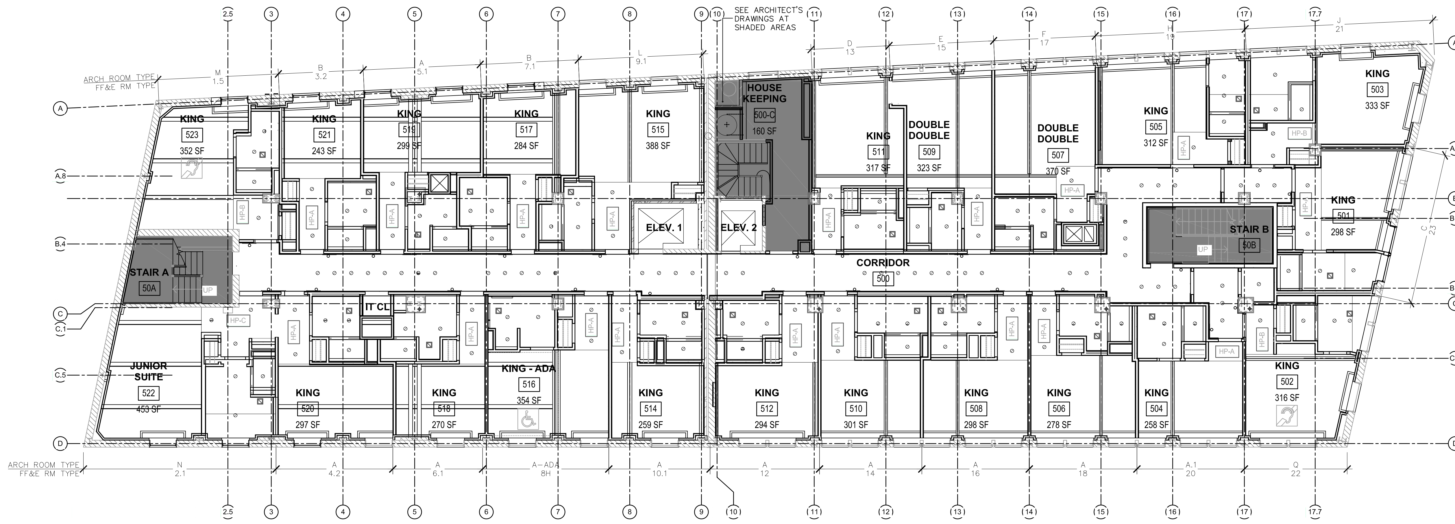
2 5TH FLOOR - RCP 1/8" = 1'-0"