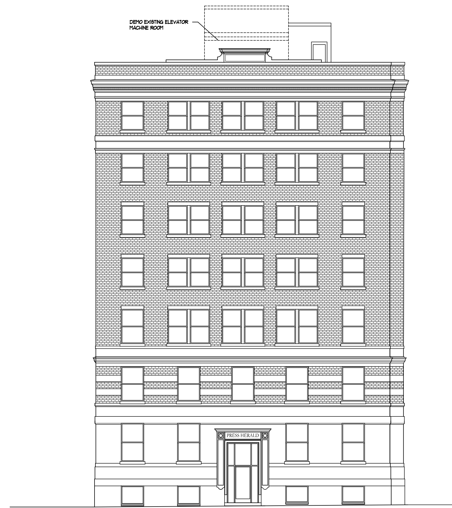
1 EXISTING FEDERAL STREET ELEVATION SCALE: 1/8"=1'-0"