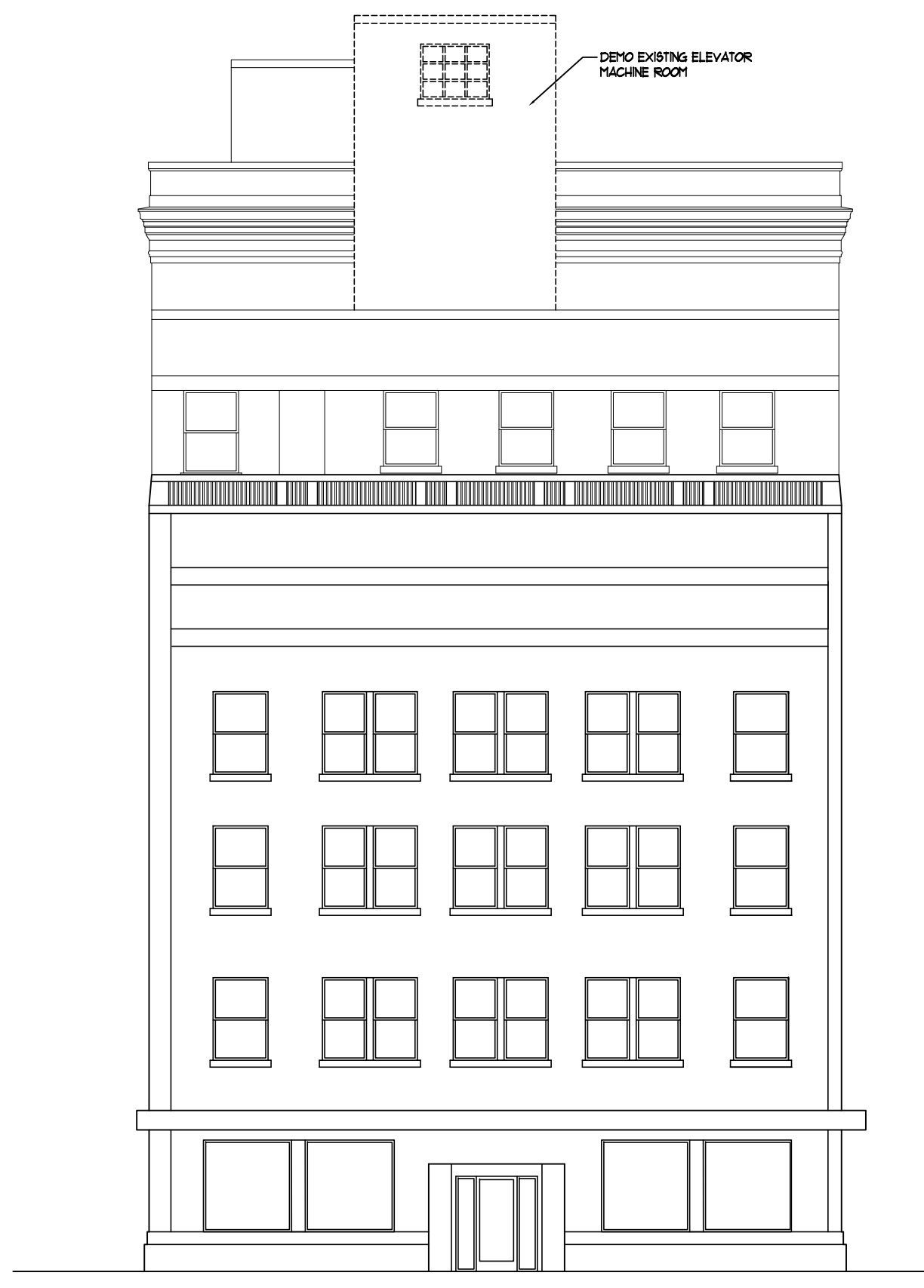
3 EXISTING CONGRESS STREET ELEVATION SCALE: 1/8"=1'-0"