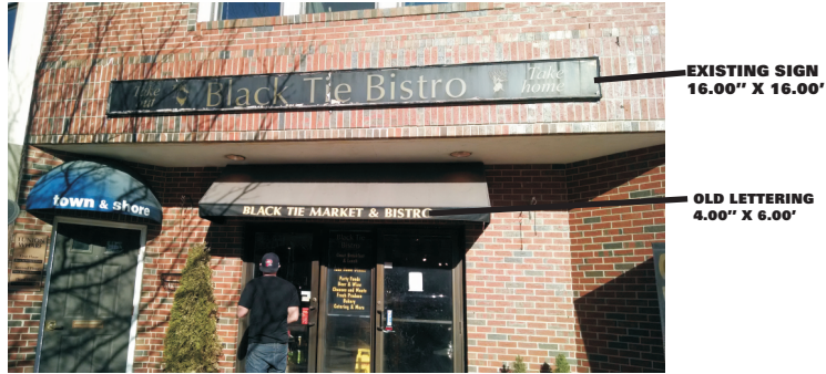
EXISTING SIGN 16.00" X 16.00"