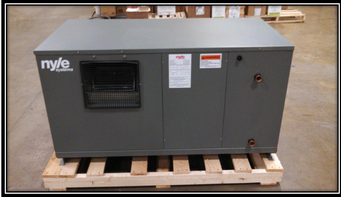
Figure 1 – Geyser C-Series Heat Pump Water Heater