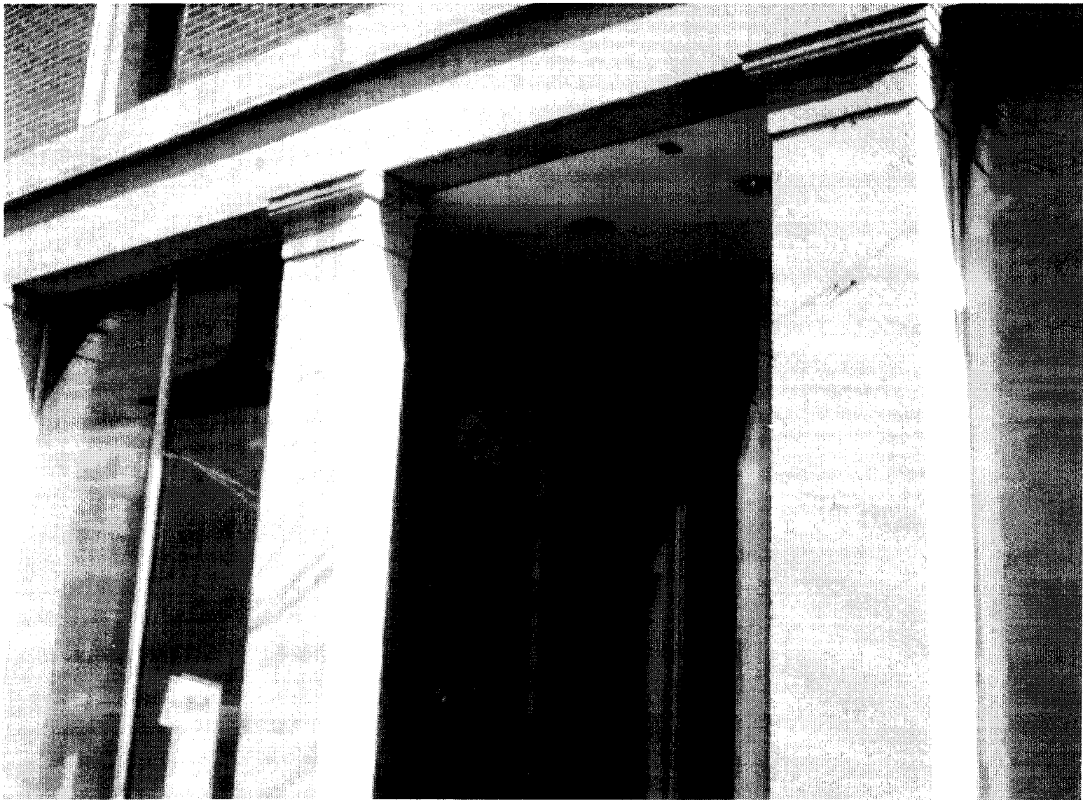
↑ This column with existing hdes.