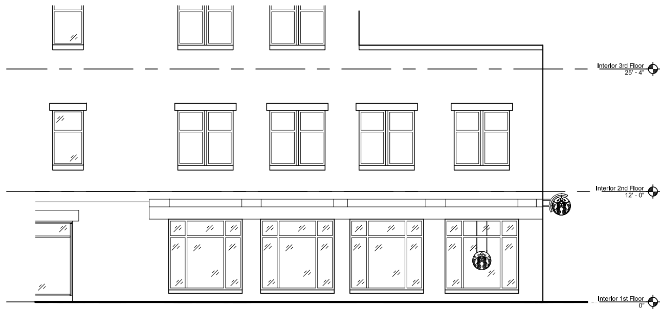
1 PARTIAL MARKET STREET ELEVATION SCALE: 3/32" = 1'-0"