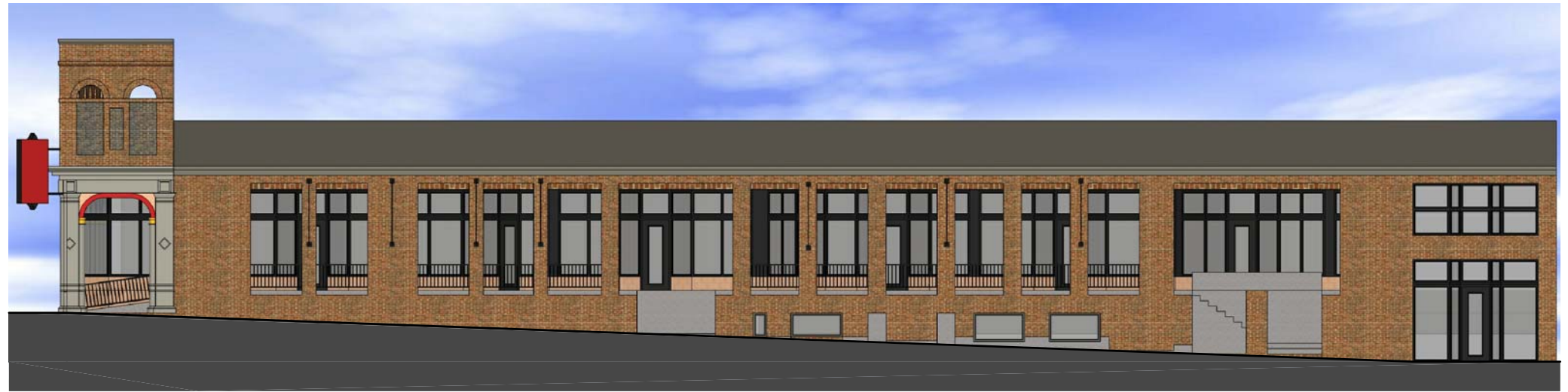
1 EXISTING MARKET ST ELEV 0 16'-0" SCALE: 1/16" = 1'-0"