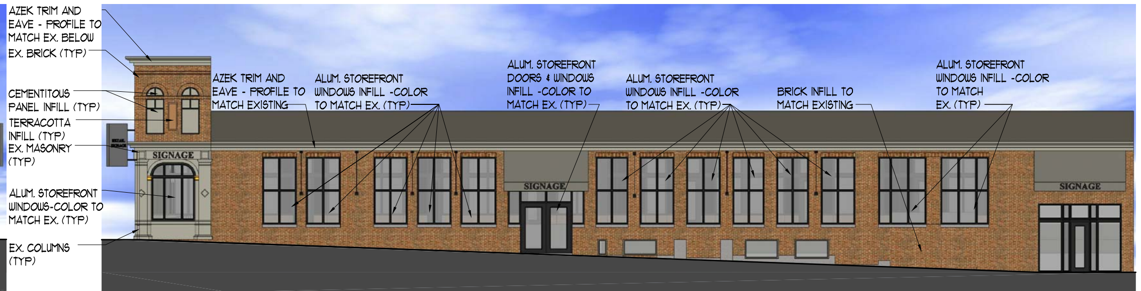
1 PROPOSED MARKET ST ELEV 0 16'-0" SCALE: 1/16" = 1'-0"

GENERAL NOTE: -EAVE DENTILS TO BE REPAIRED -ANY UNNECESSARY EXISTING HARDWARE TO BE REMOVED - EXPOSED CONDUIT TO BE CONCEALED