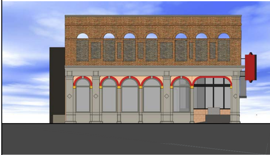
1 EXISTING MIDDLE ST ELEV 0 16'-0" SCALE: 1/16" = 1'-0"