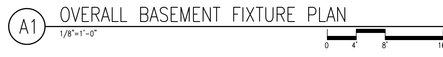
A1 OVERALL BASEMENT FIXTURE PLAN 1/8"=1'-0"