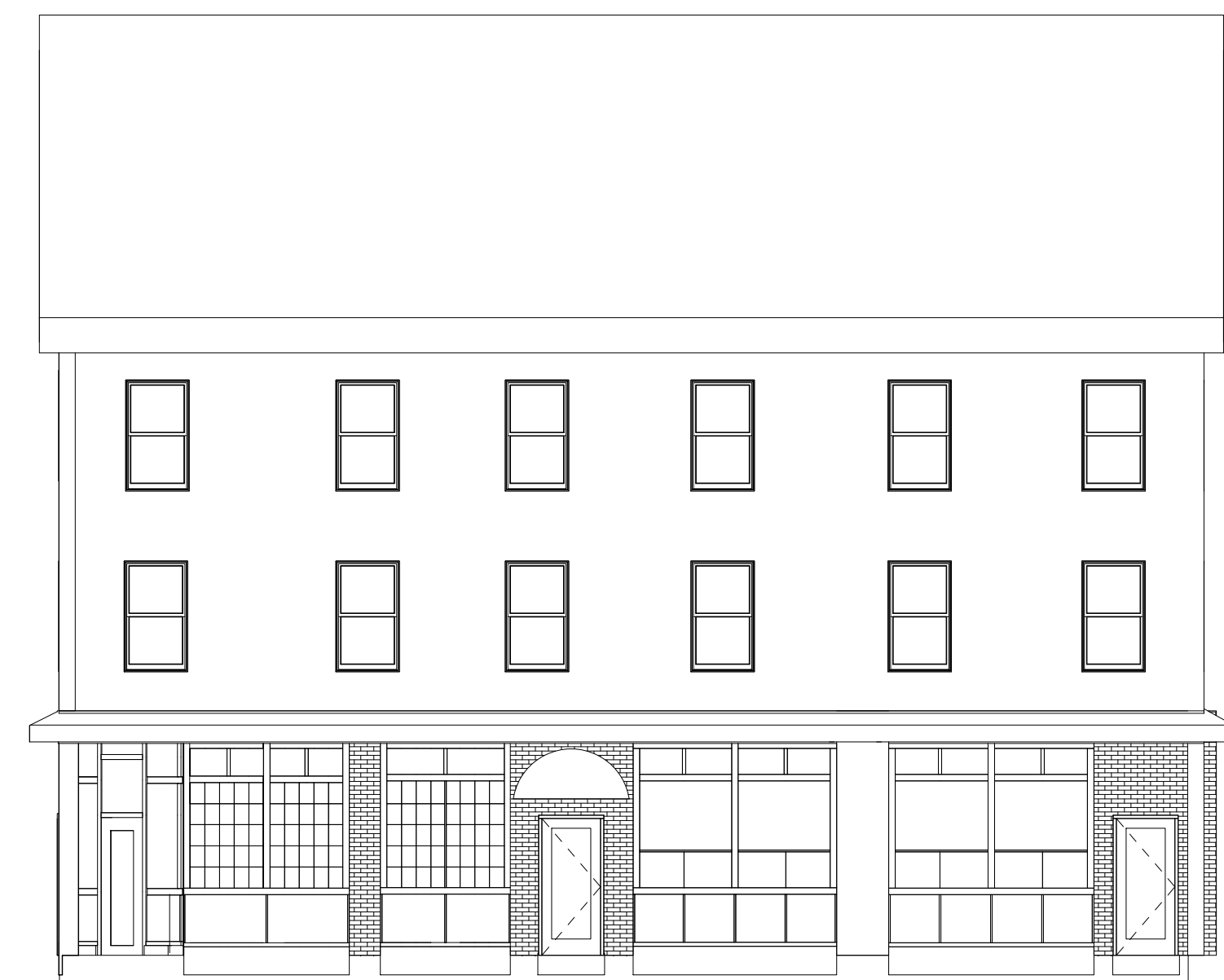
4 | NORTH ELEVATION 1/8" = 1'-0"