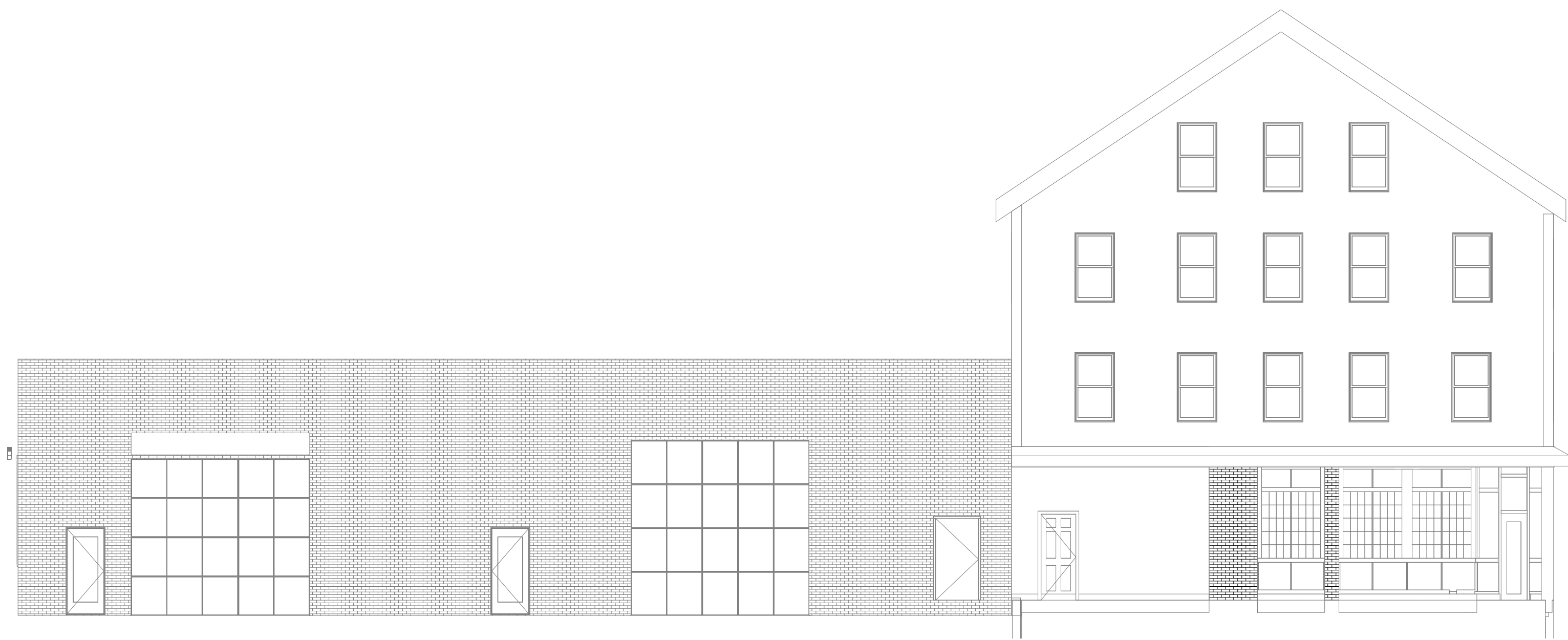
1 | EAST ELEVATION 1/8" = 1'-0"