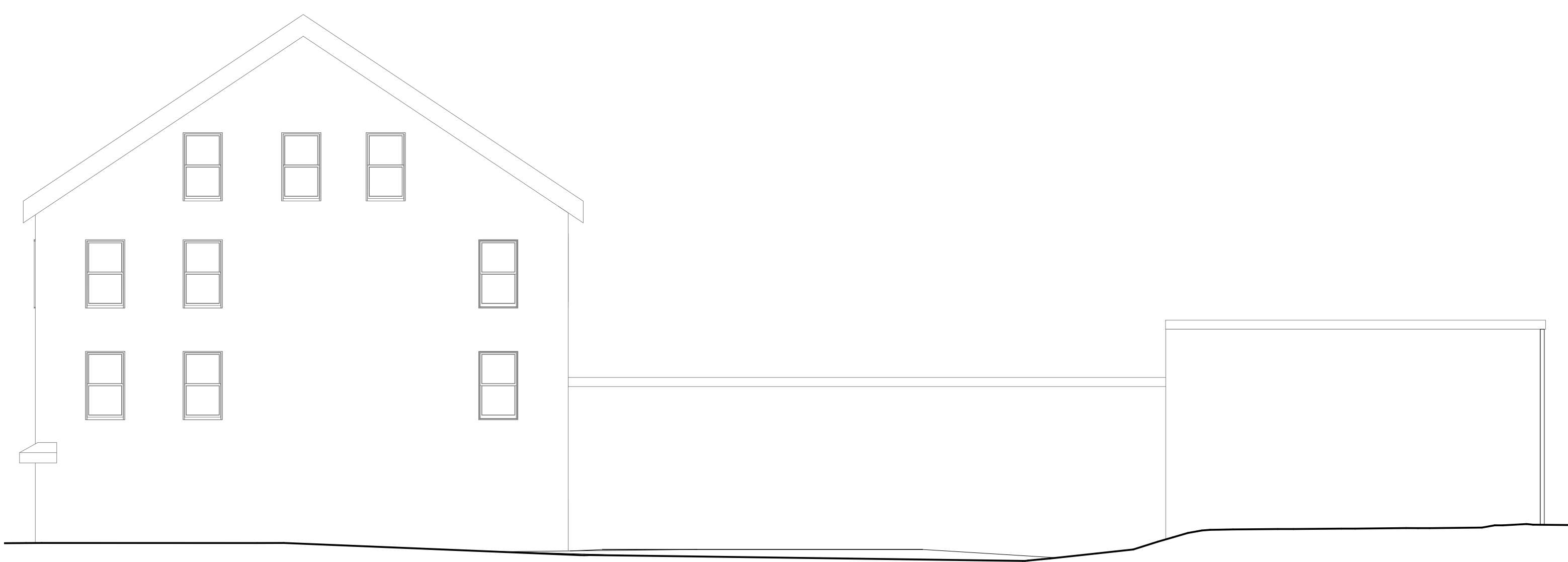
2 | WEST ELEVATION 1/8" = 1'-0"