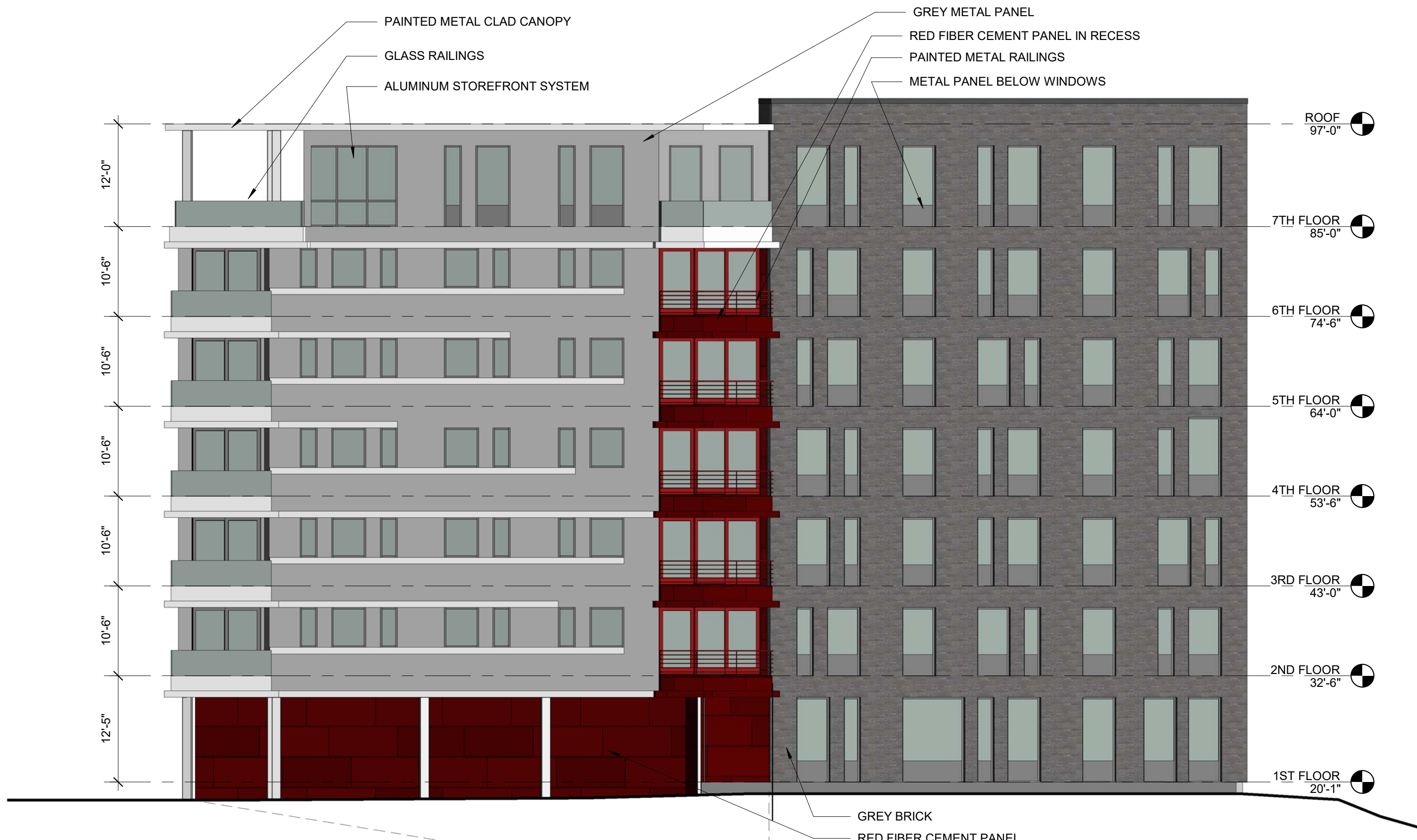
2 | WEST ELEV FRONT 3/32" = 1'-0"