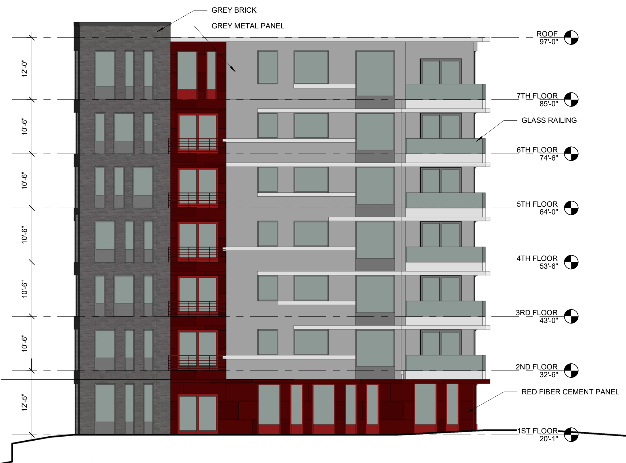
3 | SOUTH ELEVATION 3/32" = 1'-0"