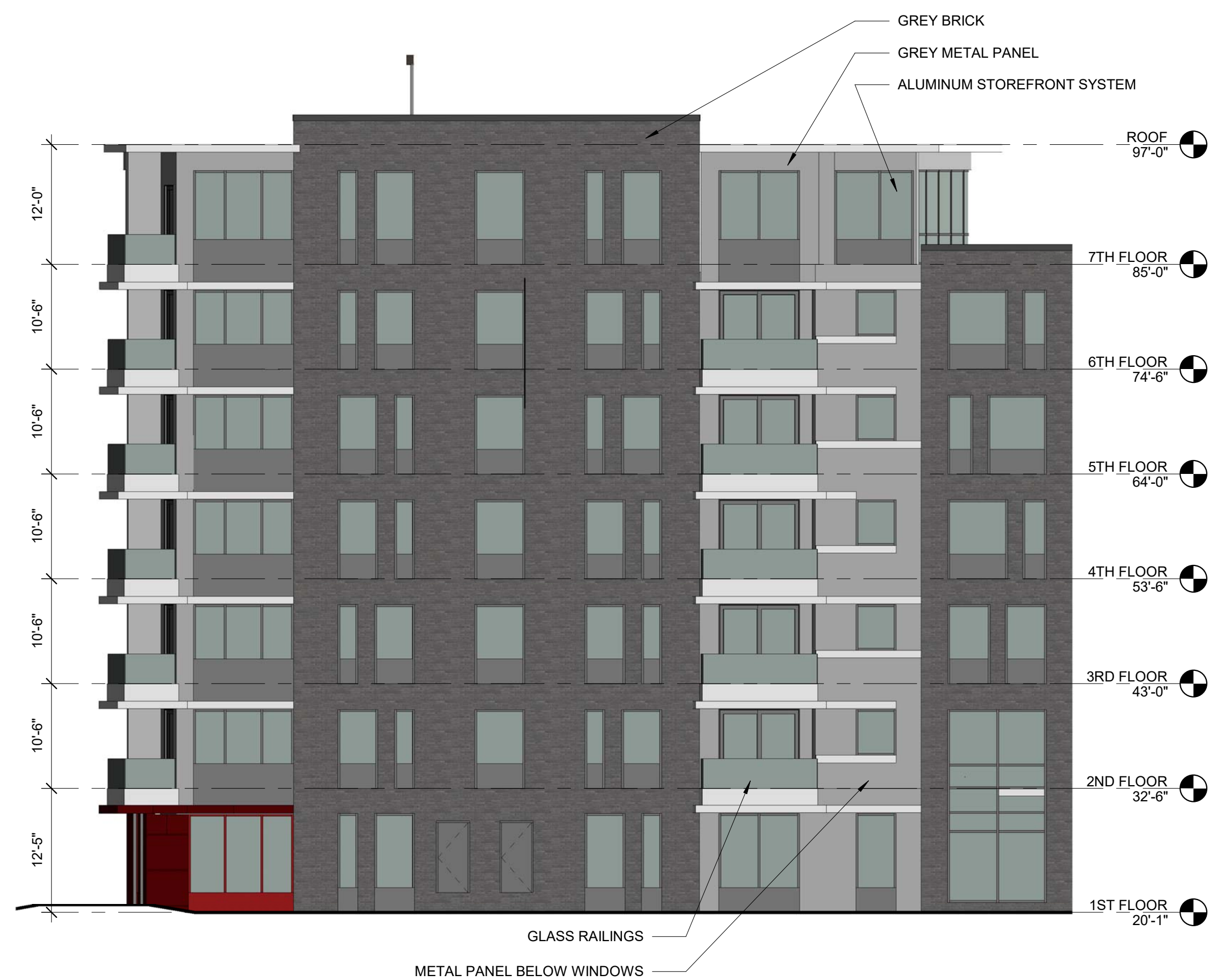
4 | EAST ELEVATION 3/32" = 1'-0"