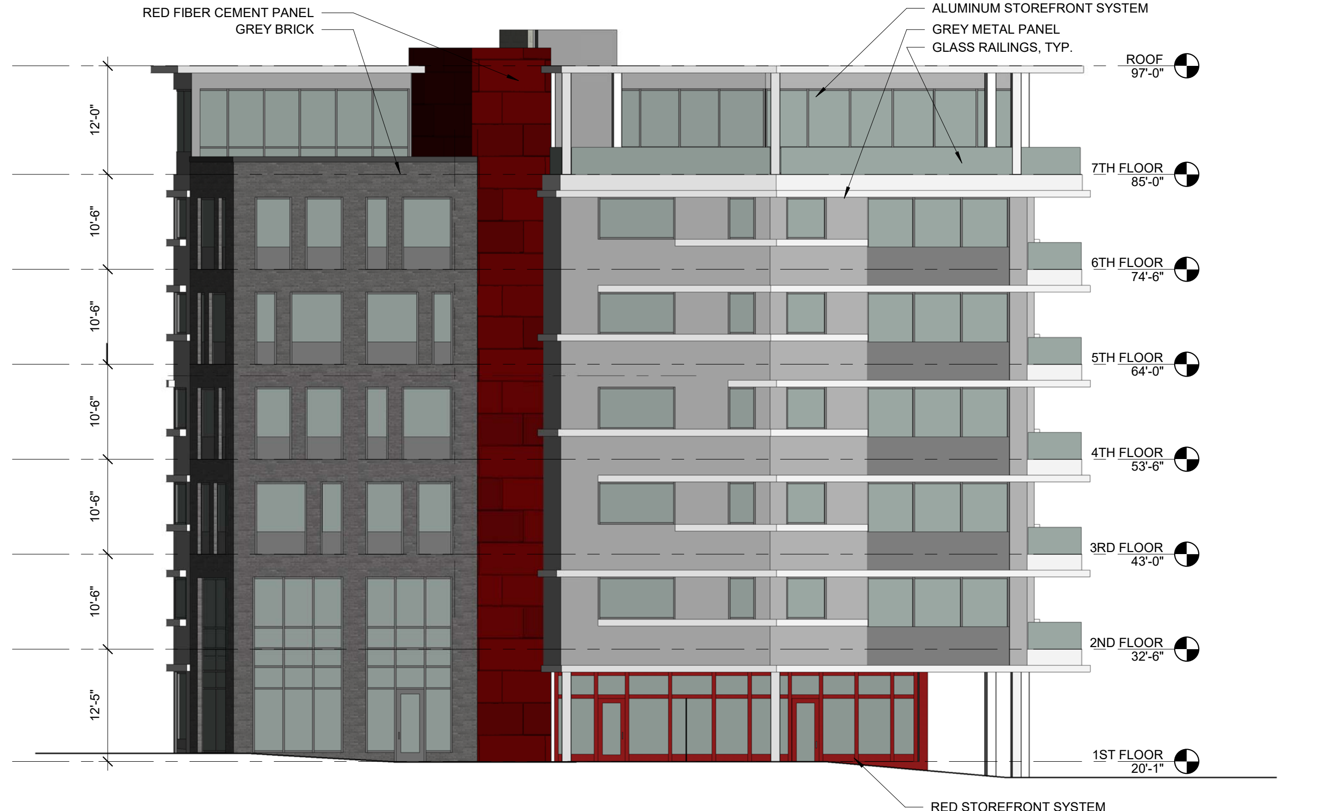
1 | FORE ST - EAST ELEV. 3/32" = 1'-0"