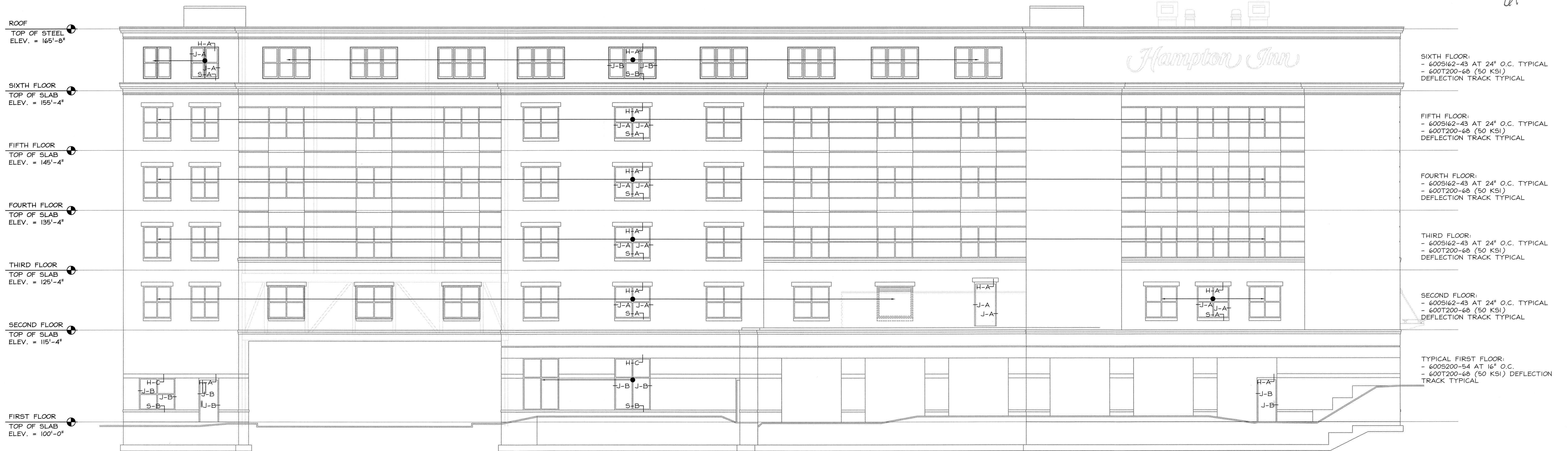
2 NORTH (BACK) ELEVATION Scale: 1/8" = 1'

One Autumn Street Portsmouth, NH 03801 (603) 433-8639 Fax: (603) 431-2811 Associates, Inc.