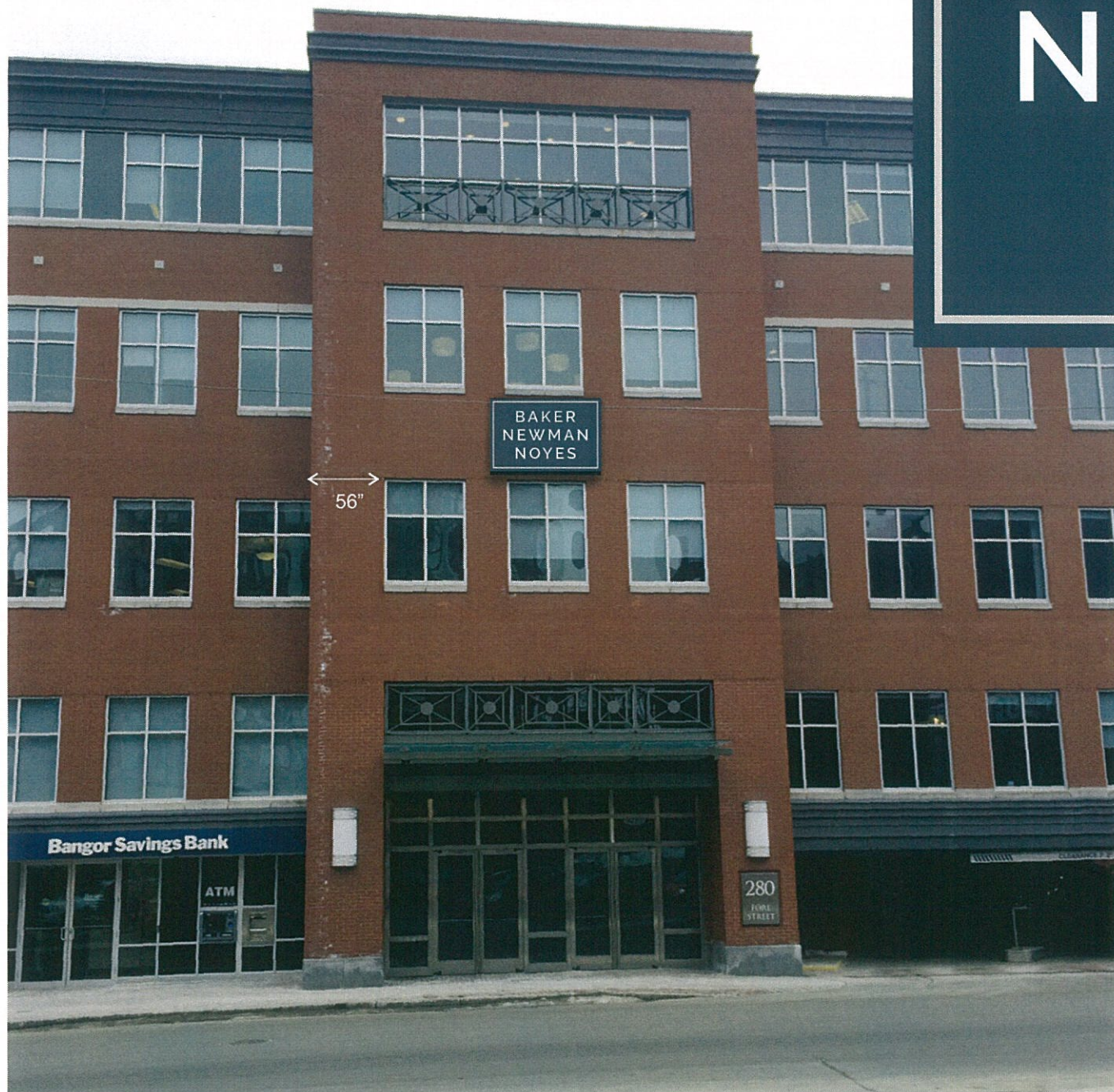
PHOTO PLOT N.T.S

MOUNTING: Angle clips into mortar joints