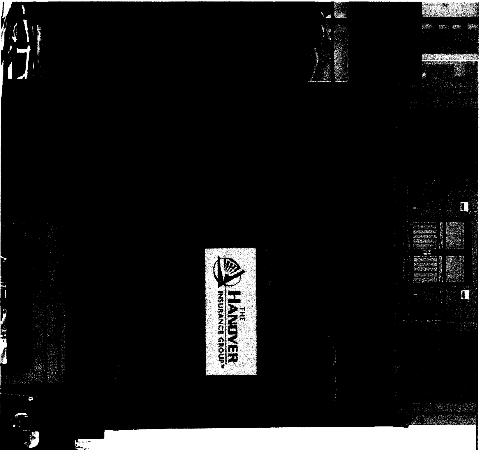
New Signage NTS

Authorized Signature _____ Appr oval Date _____