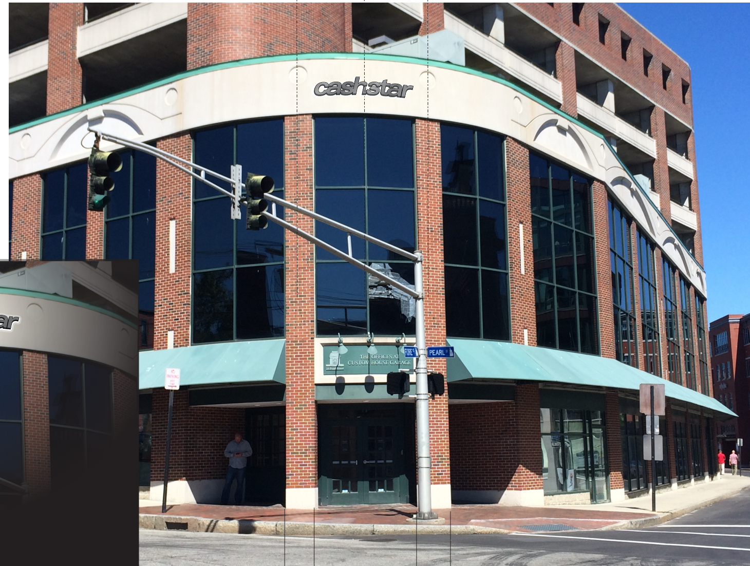
DIMENSIONS NOTED NOT TO SCALE

MOUNTING 1 1/2" OFF BUILDING FASCIA VIA THREADED ROD W/ SILICONE