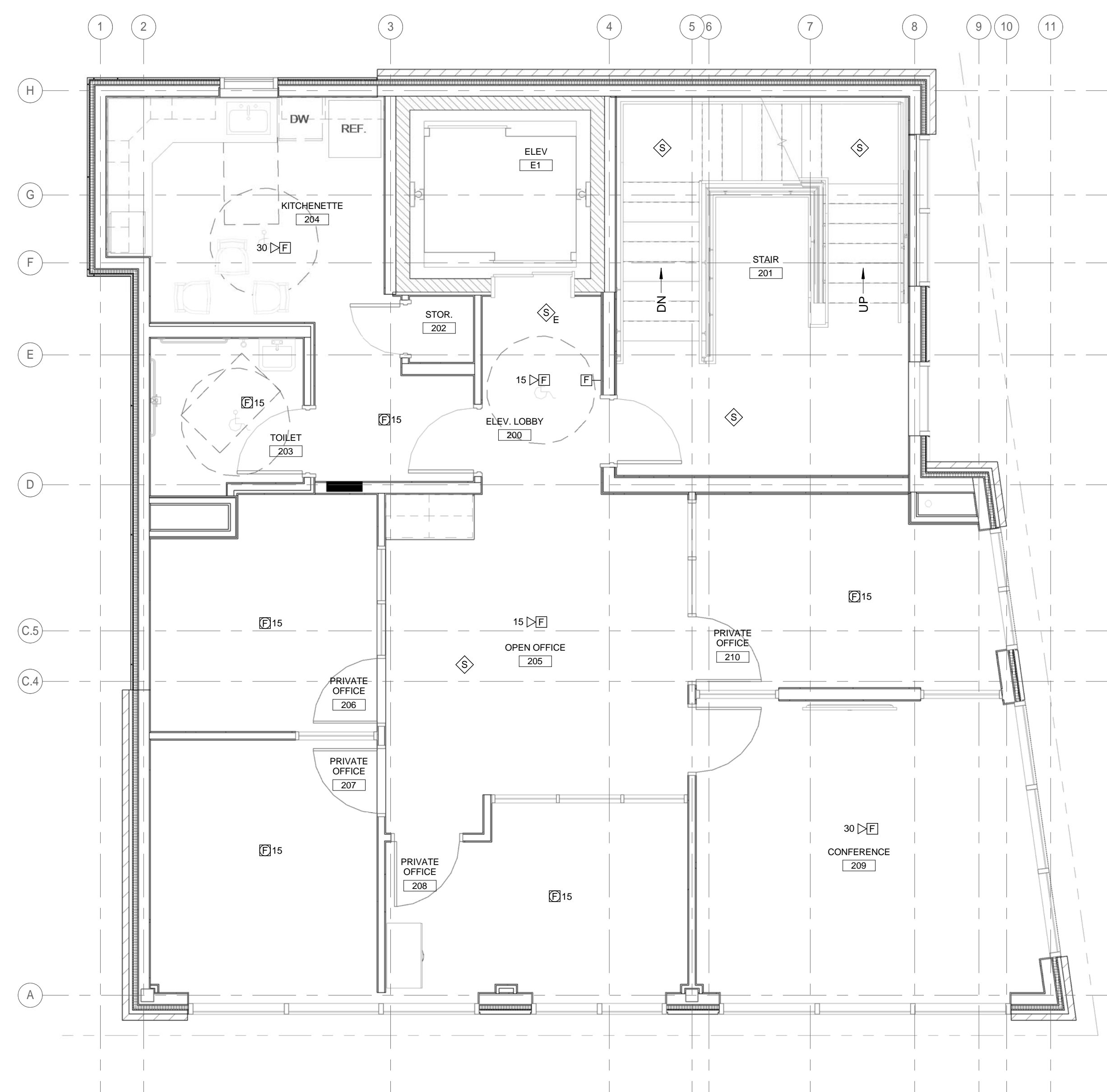
A11 LEVEL 2 FIRE ALARM PLAN 1/4" = 1'-0"