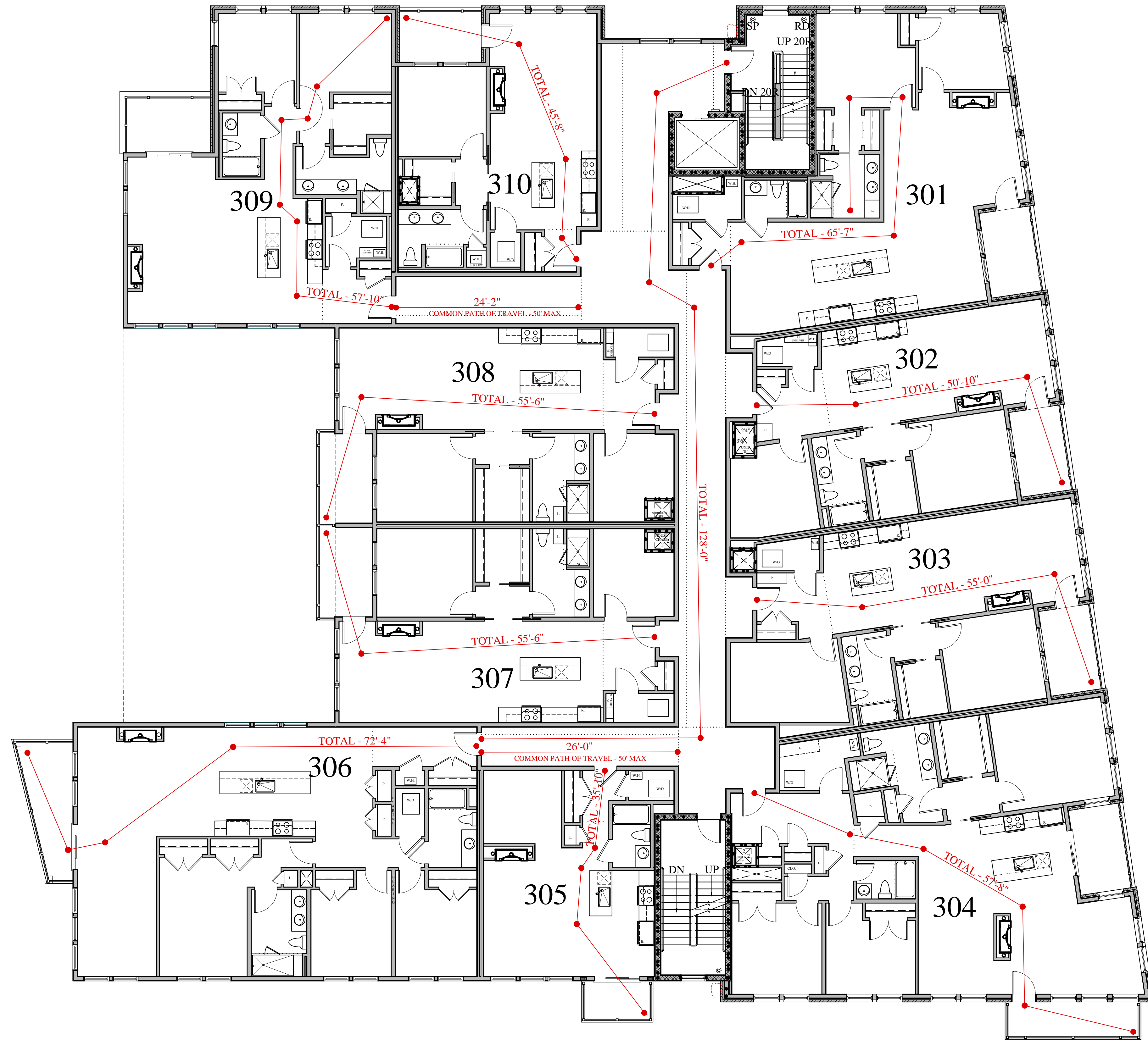
3RD FLOOR TRAVEL DISTANCES SCALE: 1/8"=1'-0"

DEAD END CORRIDOR 50' MAX. (PER NFPA 101)