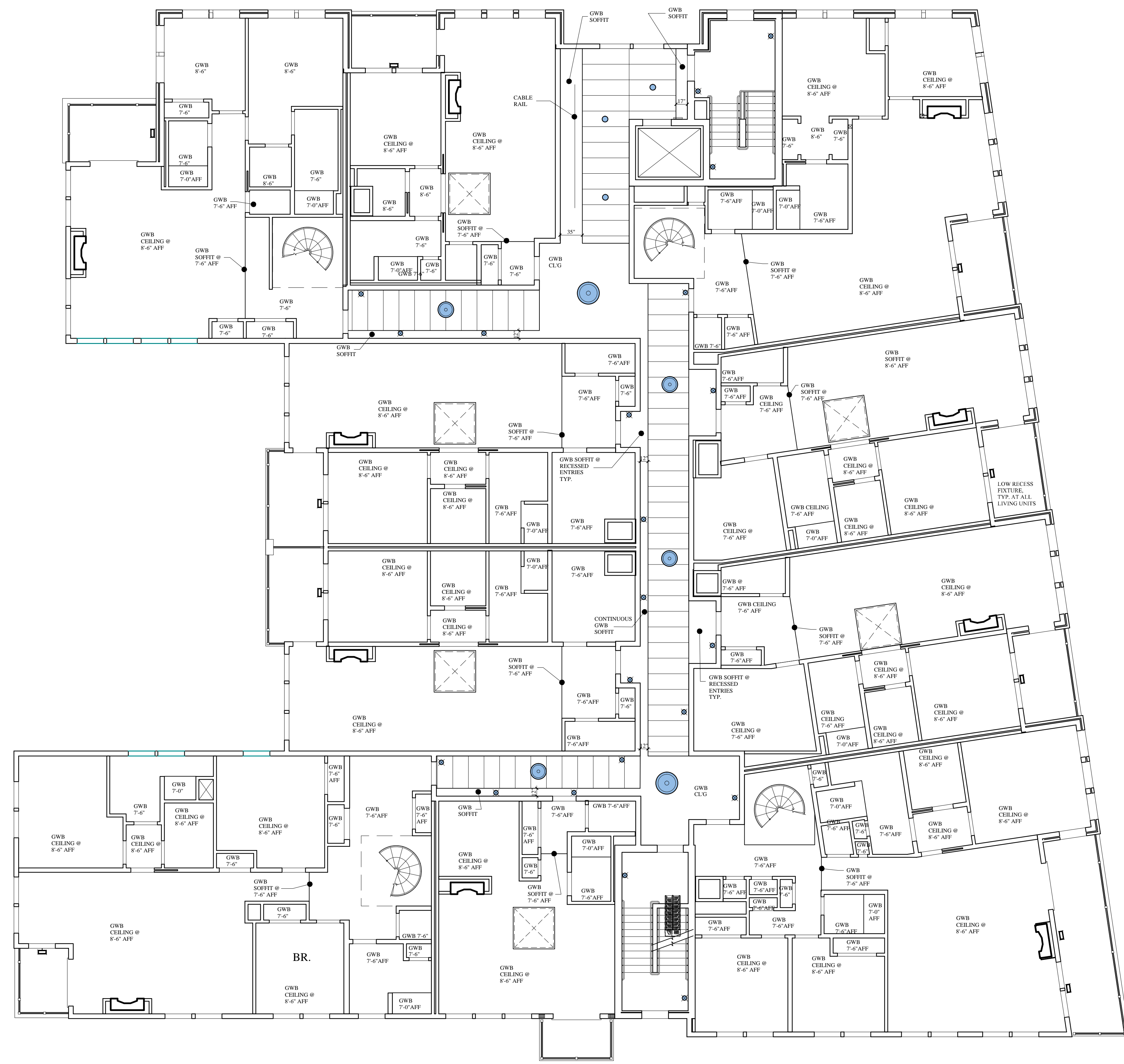
FOURTH FLOOR REFLECTED CEILING PLAN SCALE: 1/8"=1'-0"

INDIA STREET NEIGHBORHOOD PORTLAND, MAINE