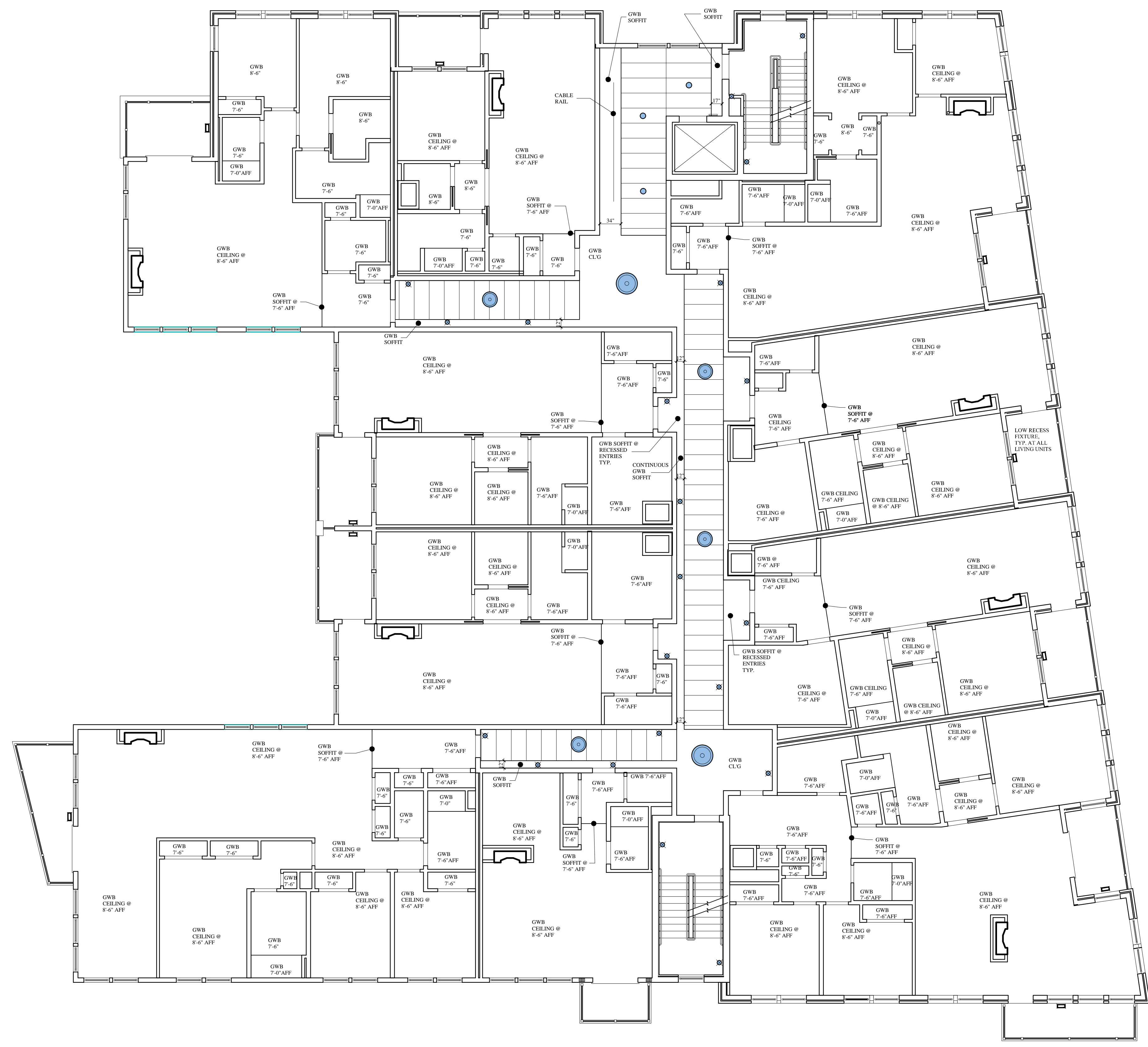
THIRD FLOOR REFLECTED CEILING PLAN SCALE: 1/8"=1'-0"

INDIA STREET NEIGHBORHOOD PORTLAND, MAINE