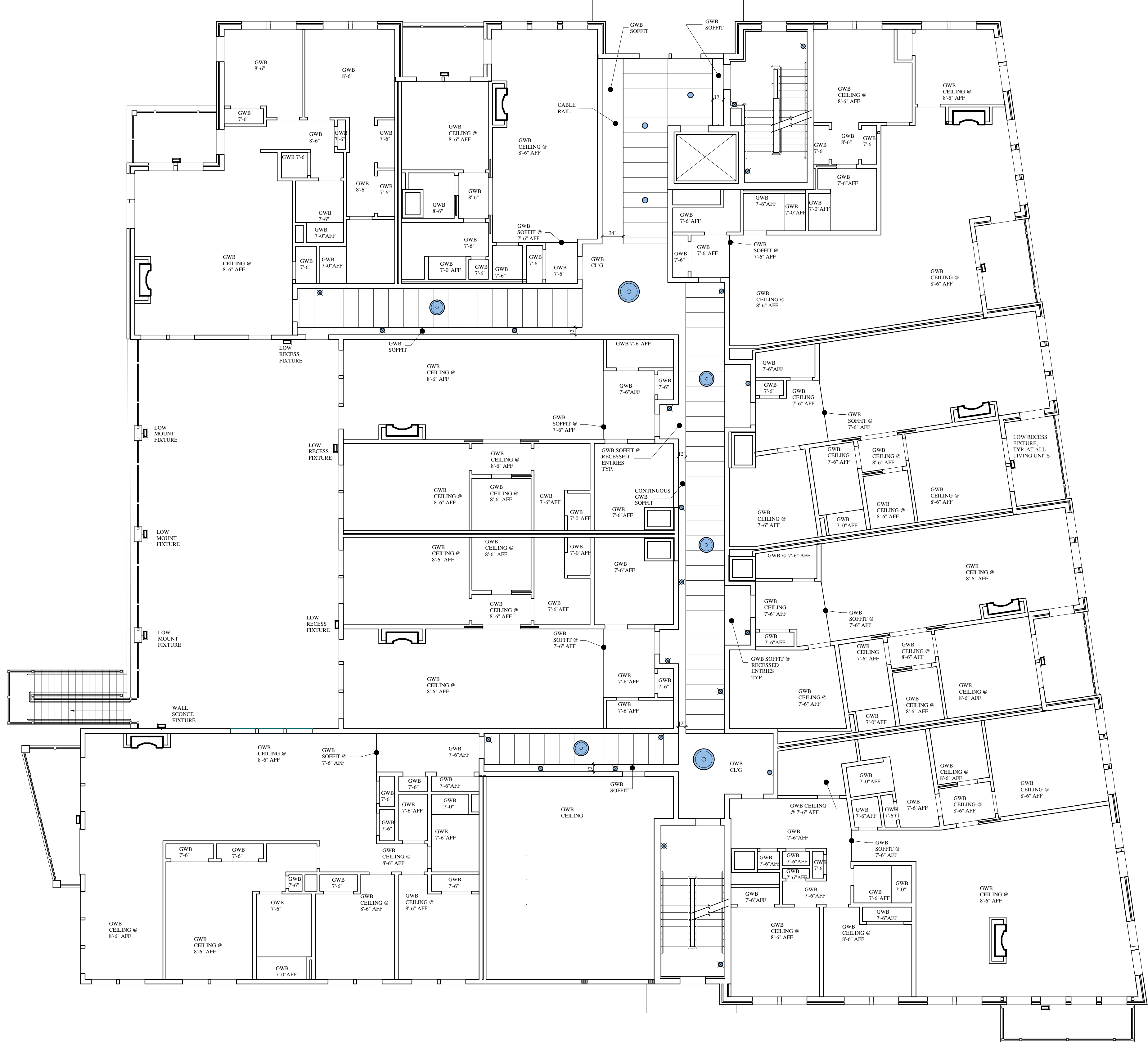
SECOND FLOOR REFLECTED CEILING PLAN SCALE: 1/8"=1'-0"

INDIA STREET NEIGHBORHOOD PORTLAND, MAINE