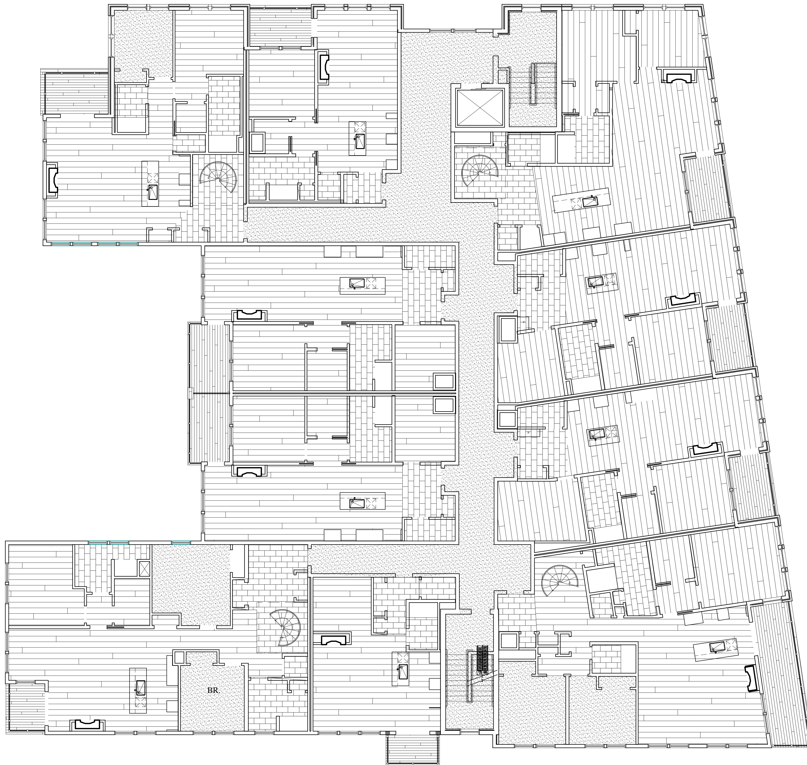
FOURTH FINISHES FLOOR PLAN SCALE: 1/8"=1'-0"

NOTE: SEE THE SECOND FLOOR PLAN FOR SIMILAR INTERIOR FINISHES AND LAYOUT