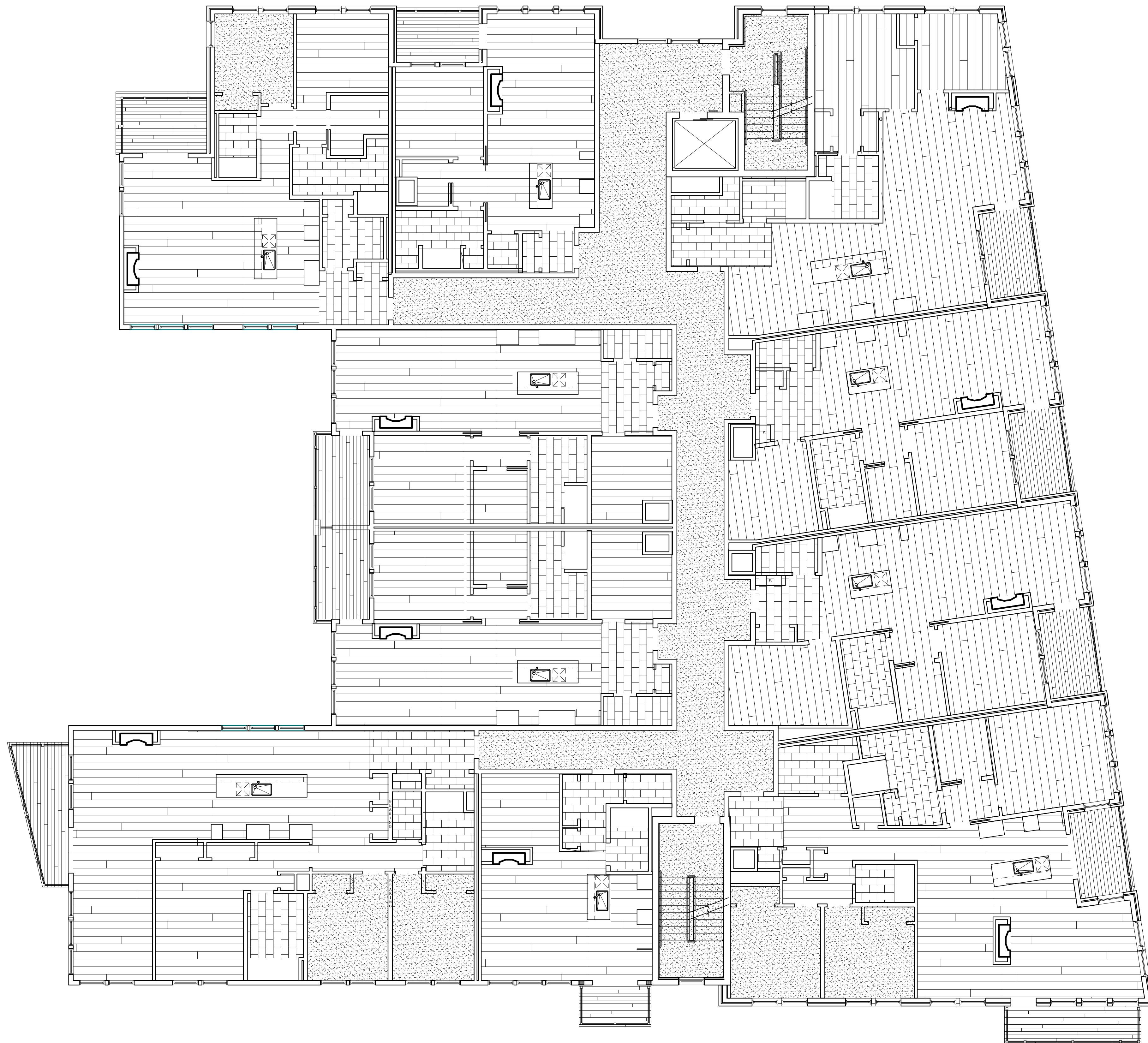
THIRD FLOOR FINISHES PLAN SCALE: 1/8"=1'-0"

NOTE: SEE THE SECOND FLOOR PLAN FOR SIMILAR INTERIOR FINISHES AND LAYOUT