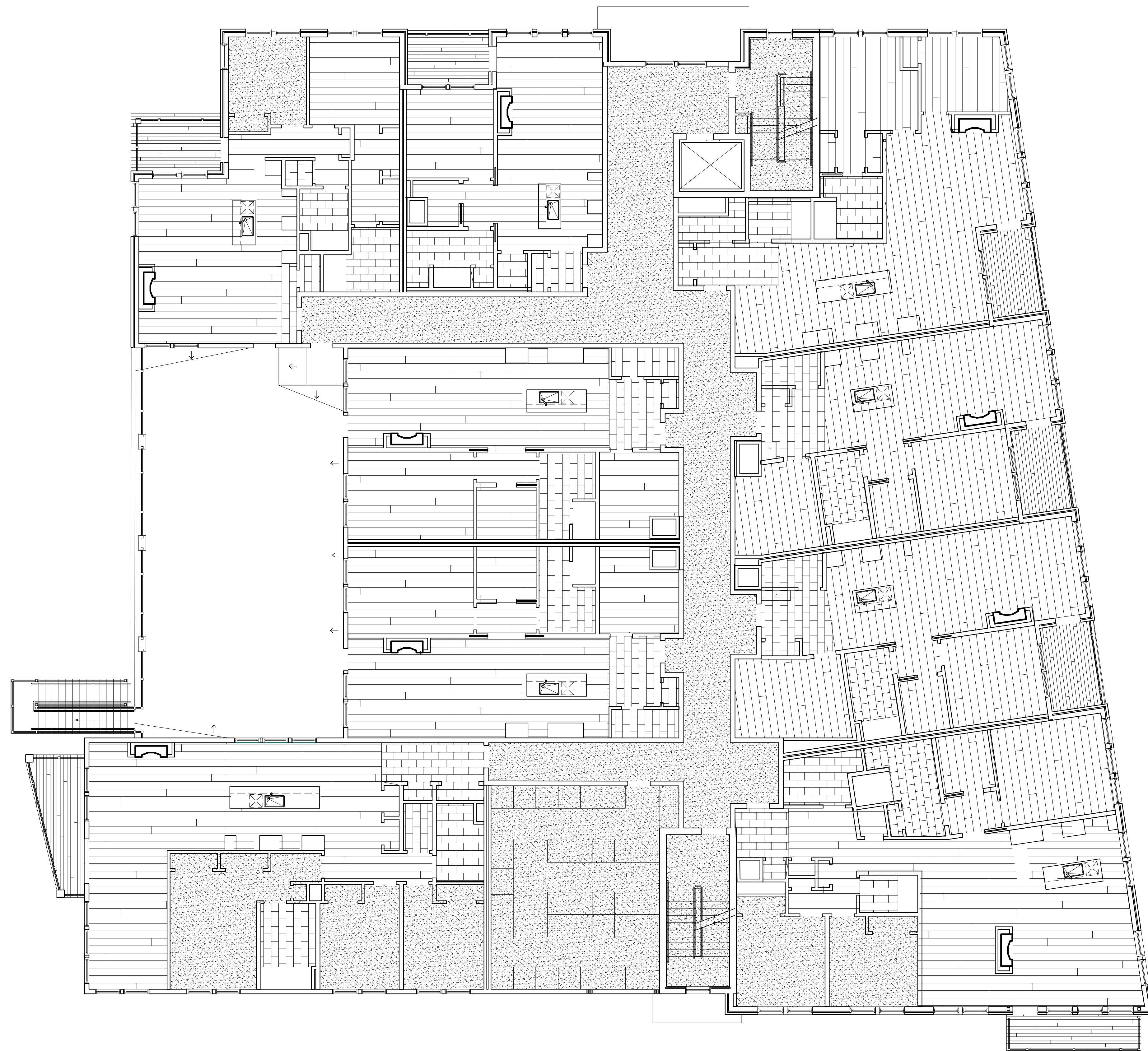
SECOND FLOOR FINISHES PLAN SCALE: 1/8"=1'-0"