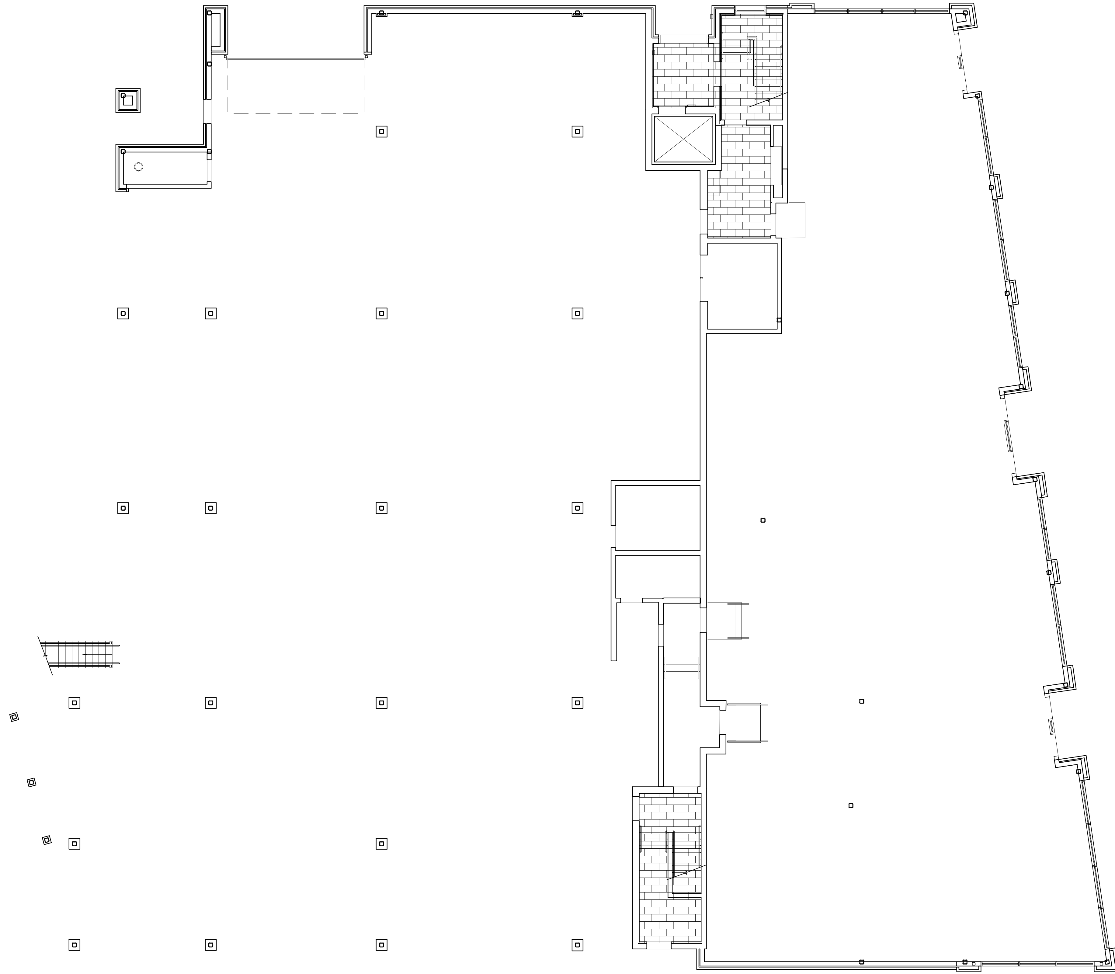
FIRST FLOOR FINISHES PLAN SCALE: 1/8"=1'-0"