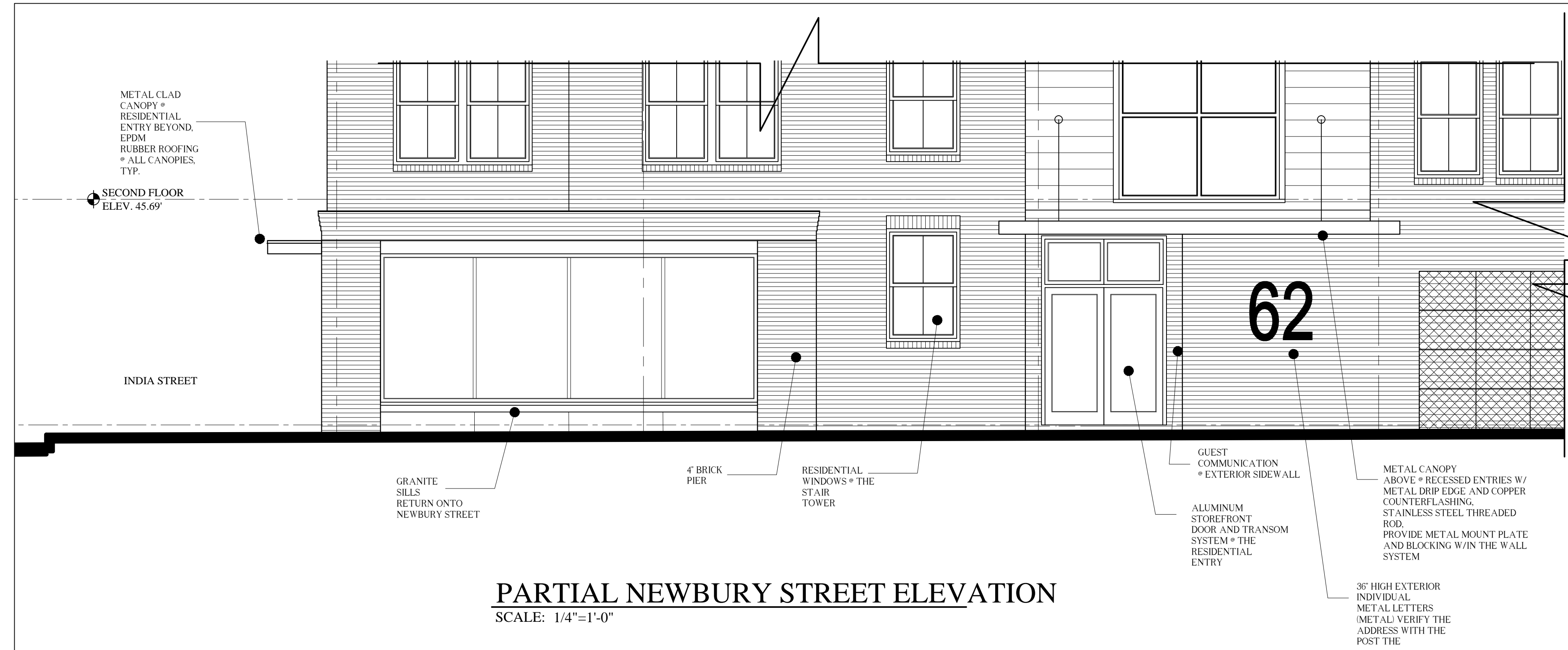
PARTIAL NEWBURY STREET ELEVATION SCALE: 1/4"=1'-0"