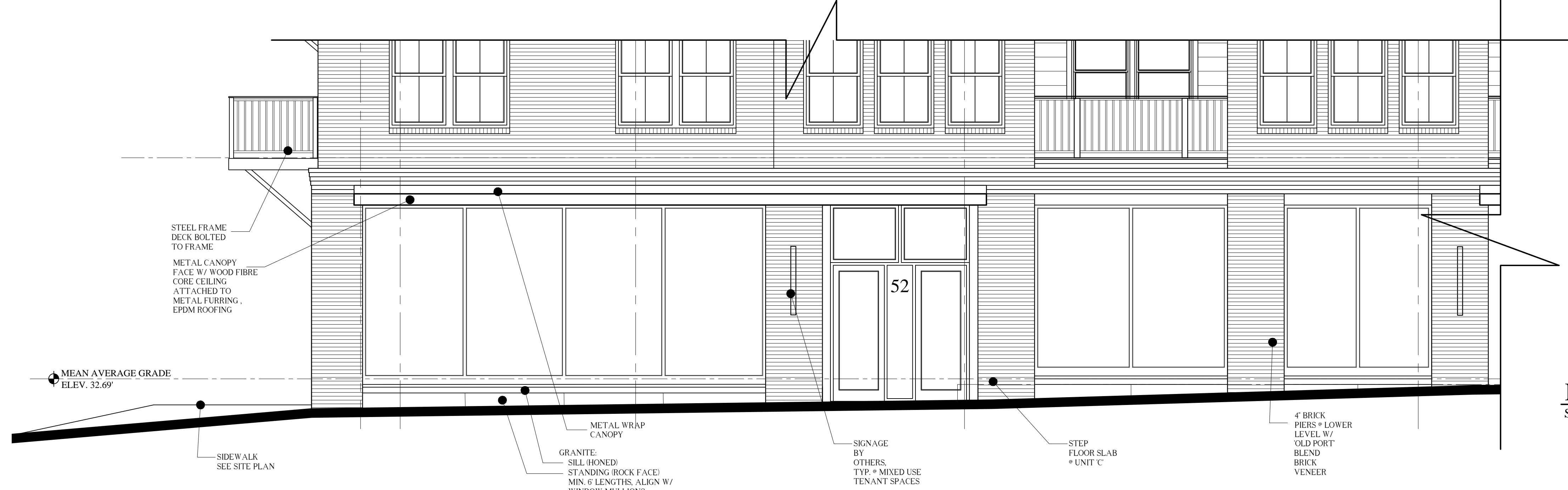
INDIA STREET ELEVATION - (CONT.) SCALE: 1/4"=1'-0"