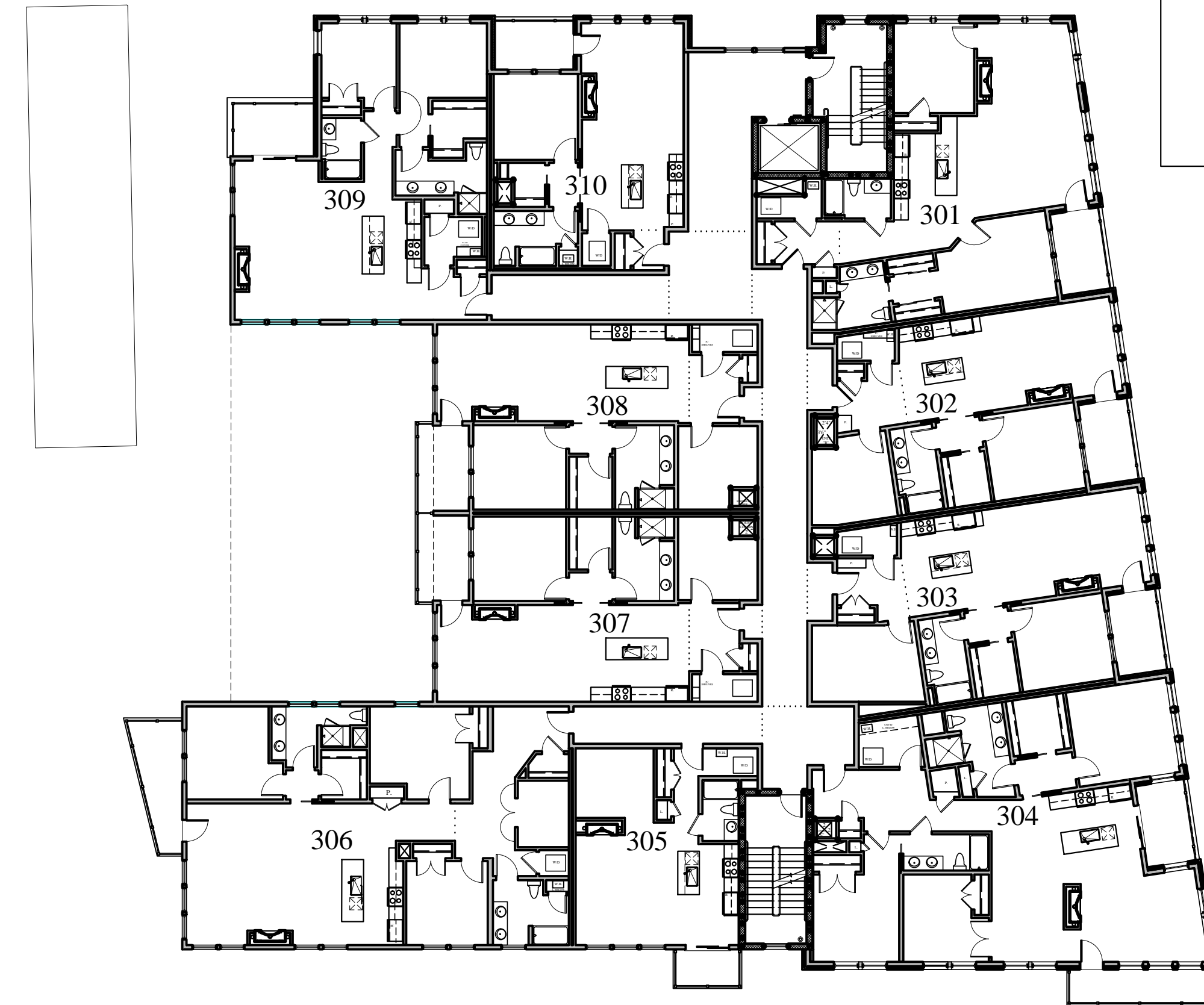
THIRD FLOOR PLAN SCALE: 1/16"=1'-0"