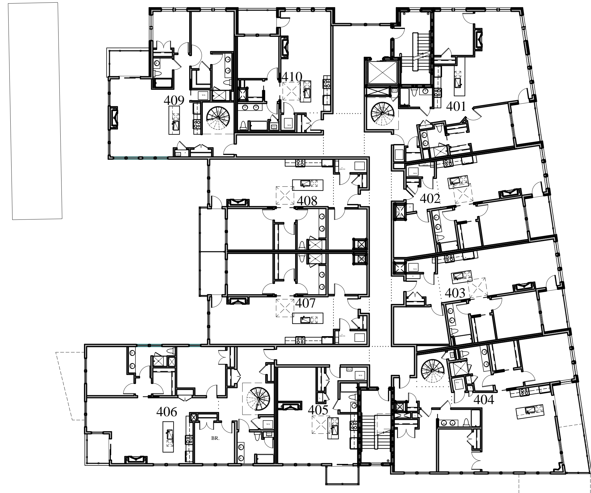
FOURTH FLOOR PLAN SCALE: 1/16"=1'-0"