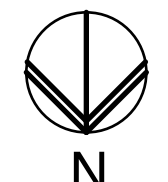
1 Roof Demolition Plan 1/8" = 1'-0"