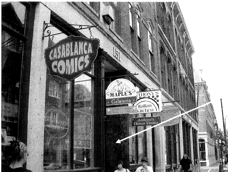
Entrance into retail area off of Middle Street