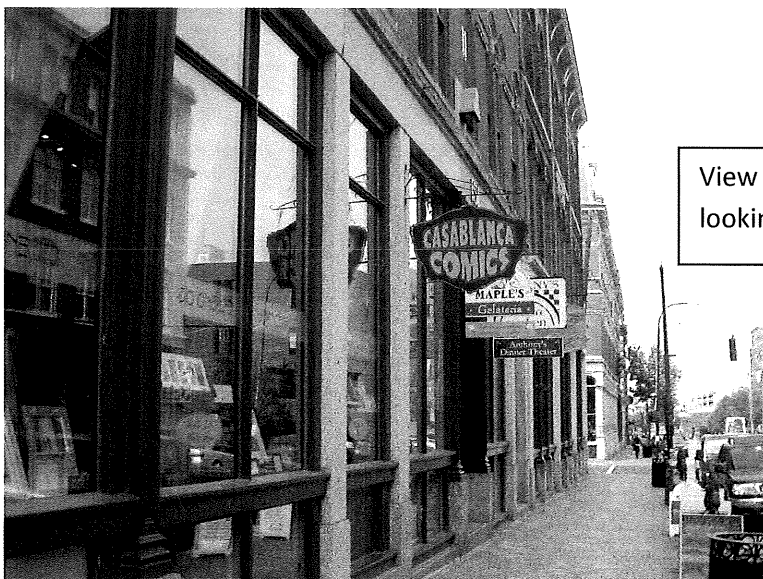
View down Middle St. looking toward Franklin