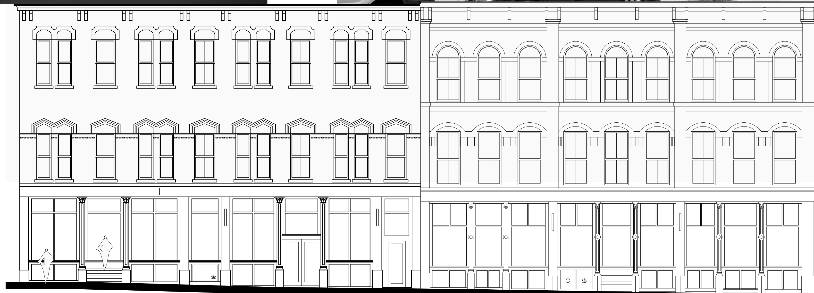
BERRY SHOE BLOCK