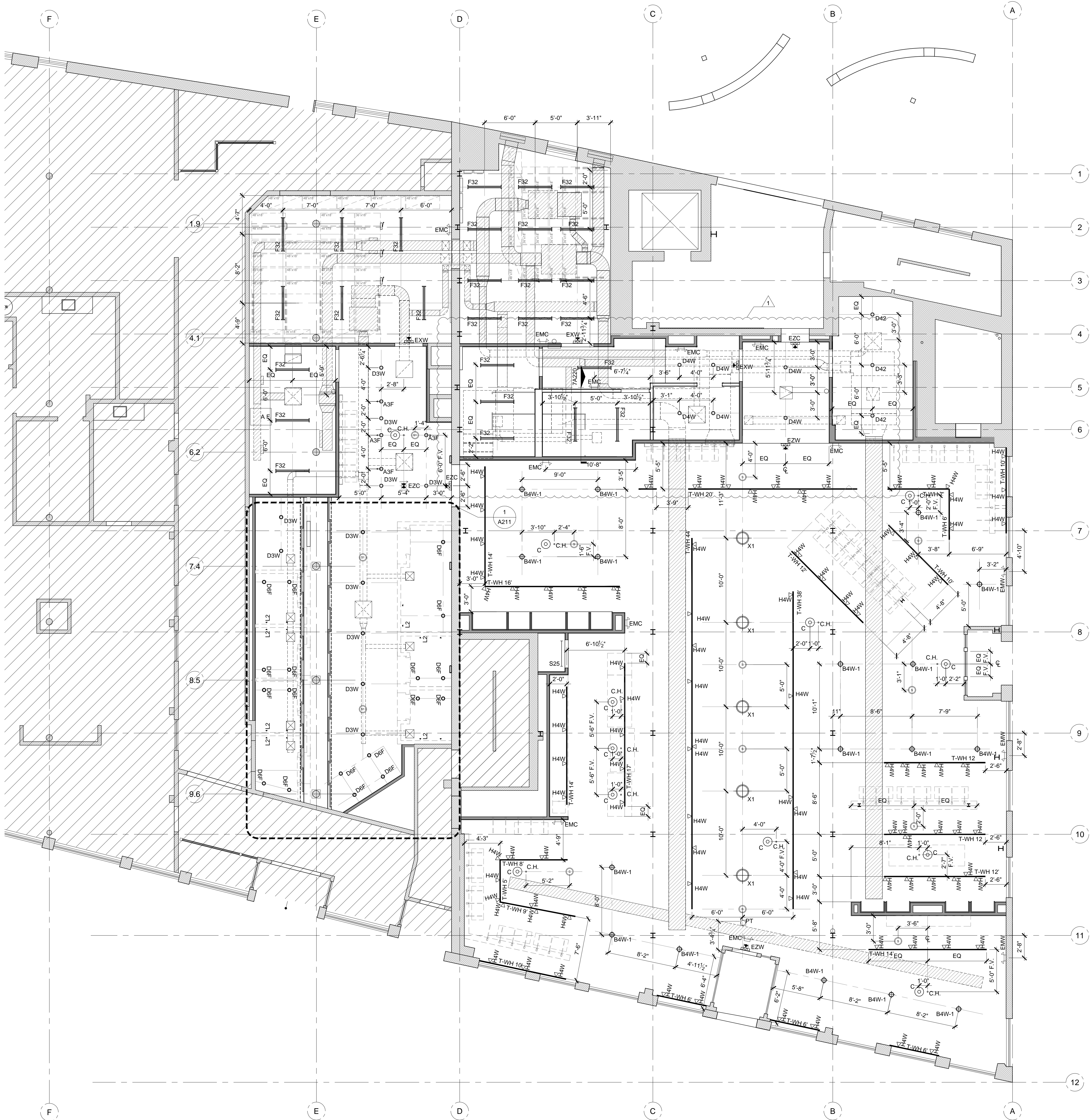
1 DIMENSIONED CEILING PLAN