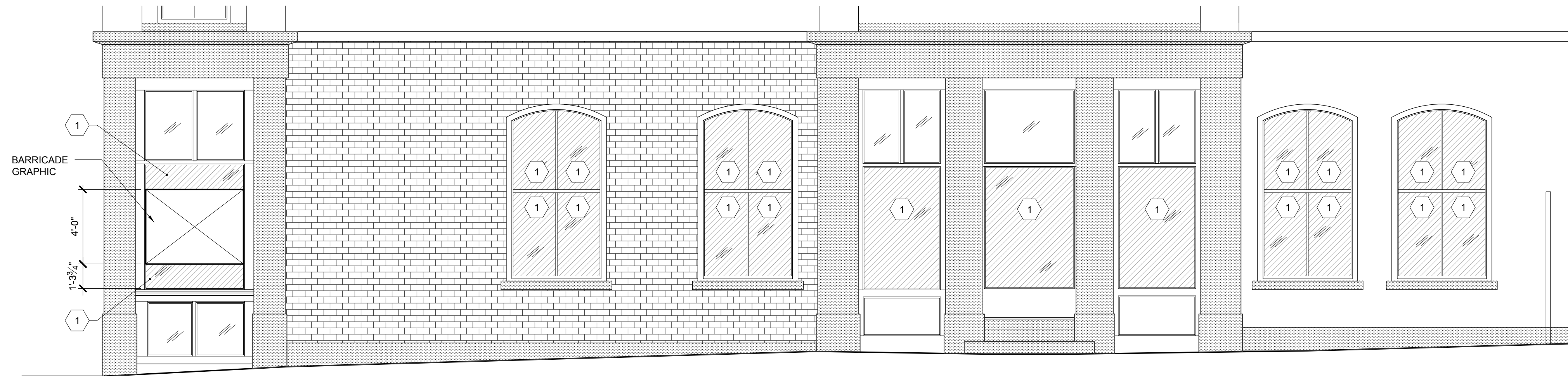
3 BARRICADE ELEVATION AT PEARL STREET