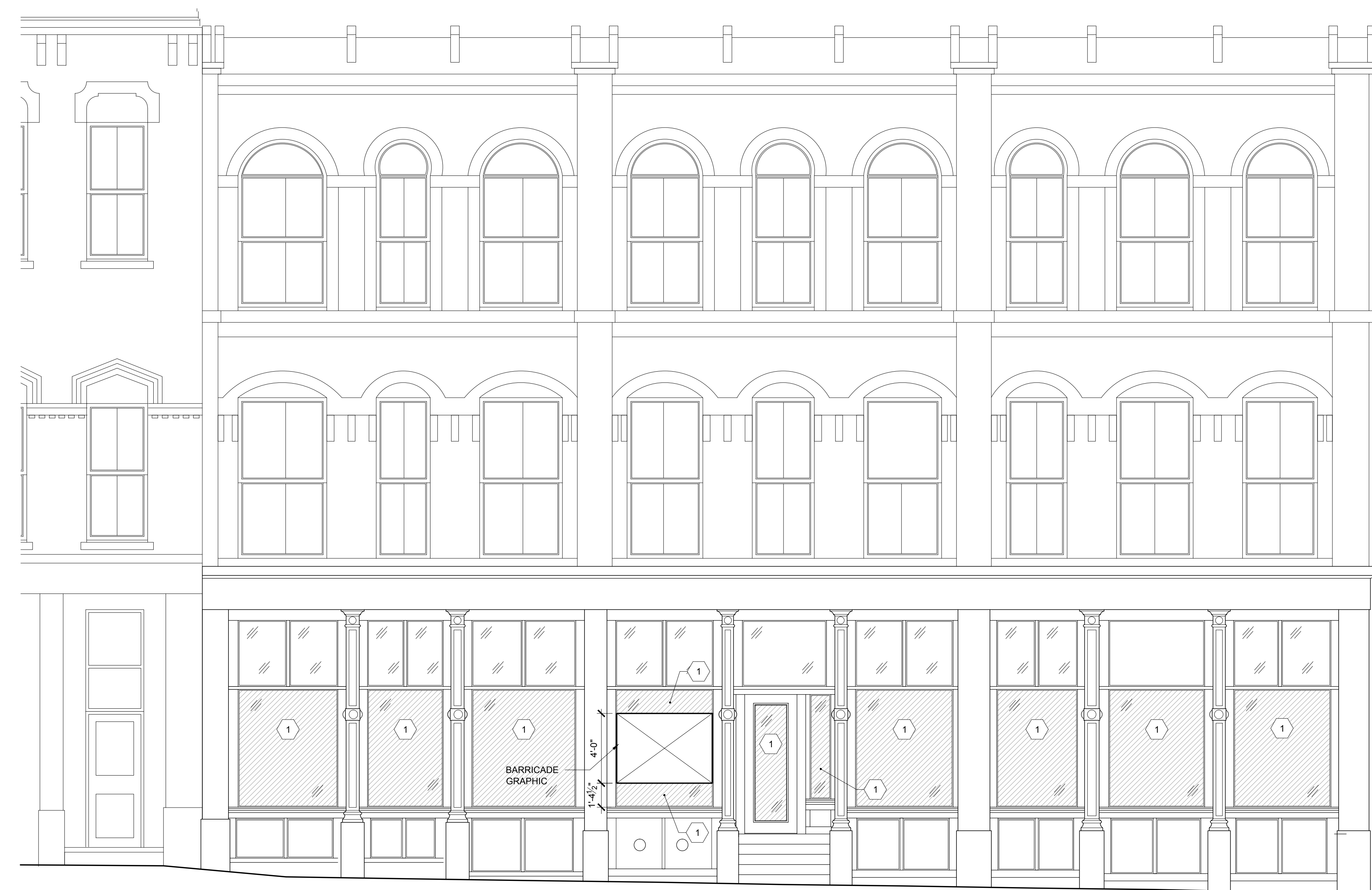
1 BARRICADE ELEVATION AT MIDDLE STREET