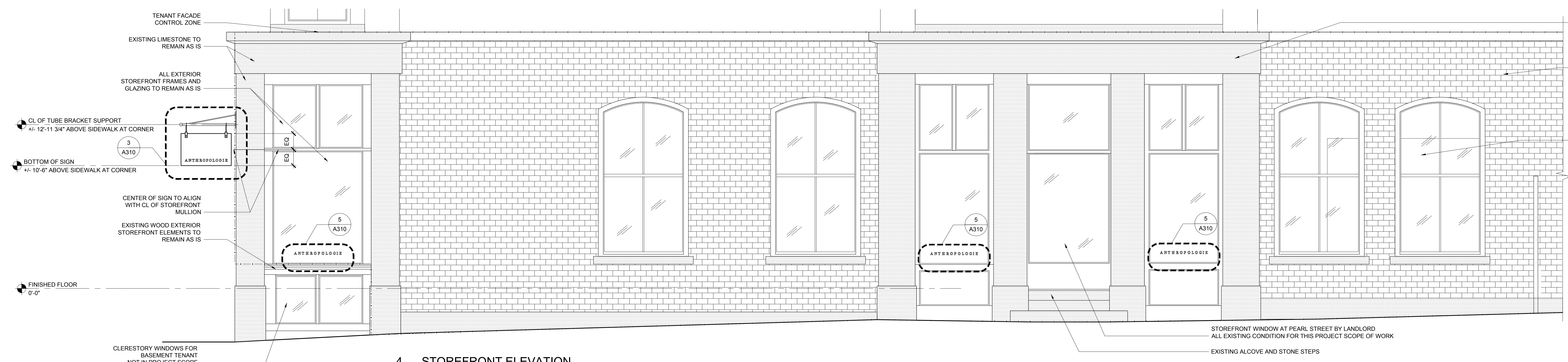
4 STOREFRONT ELEVATION A300 SCALE: 3/8" = 1'-0"