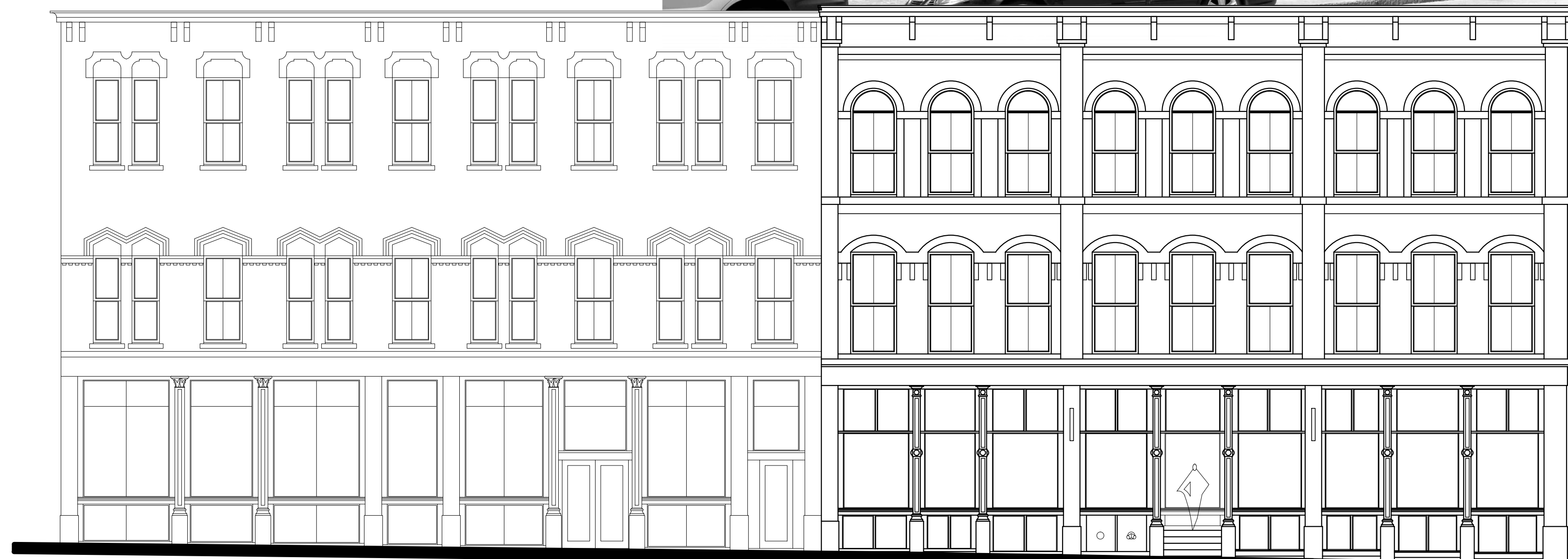
BERRY SHOE BLOCK