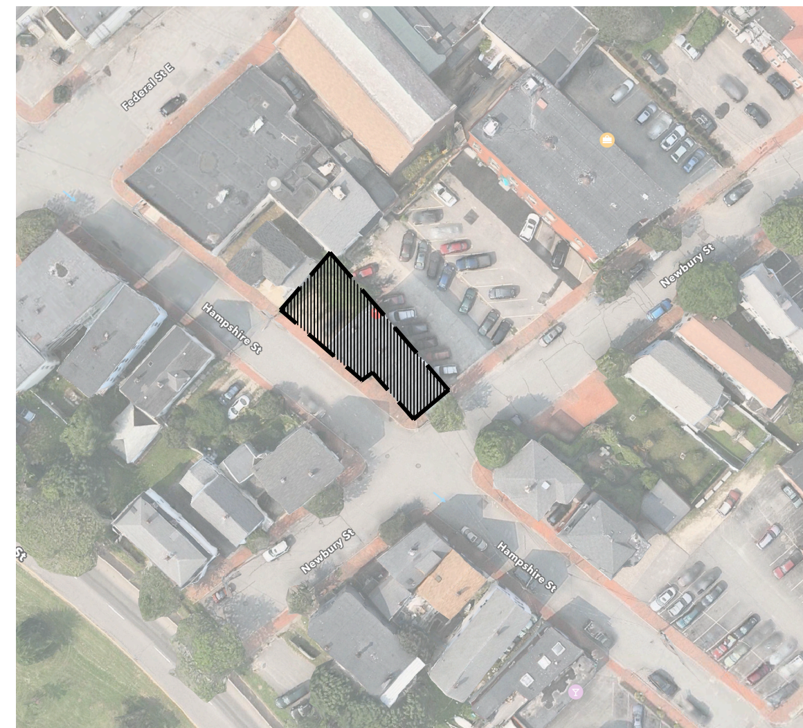
KEY PLAN: HATCH REPRESENTS AREA OF PROPOSED INTERIOR RENOVATION & DECK ADDITION