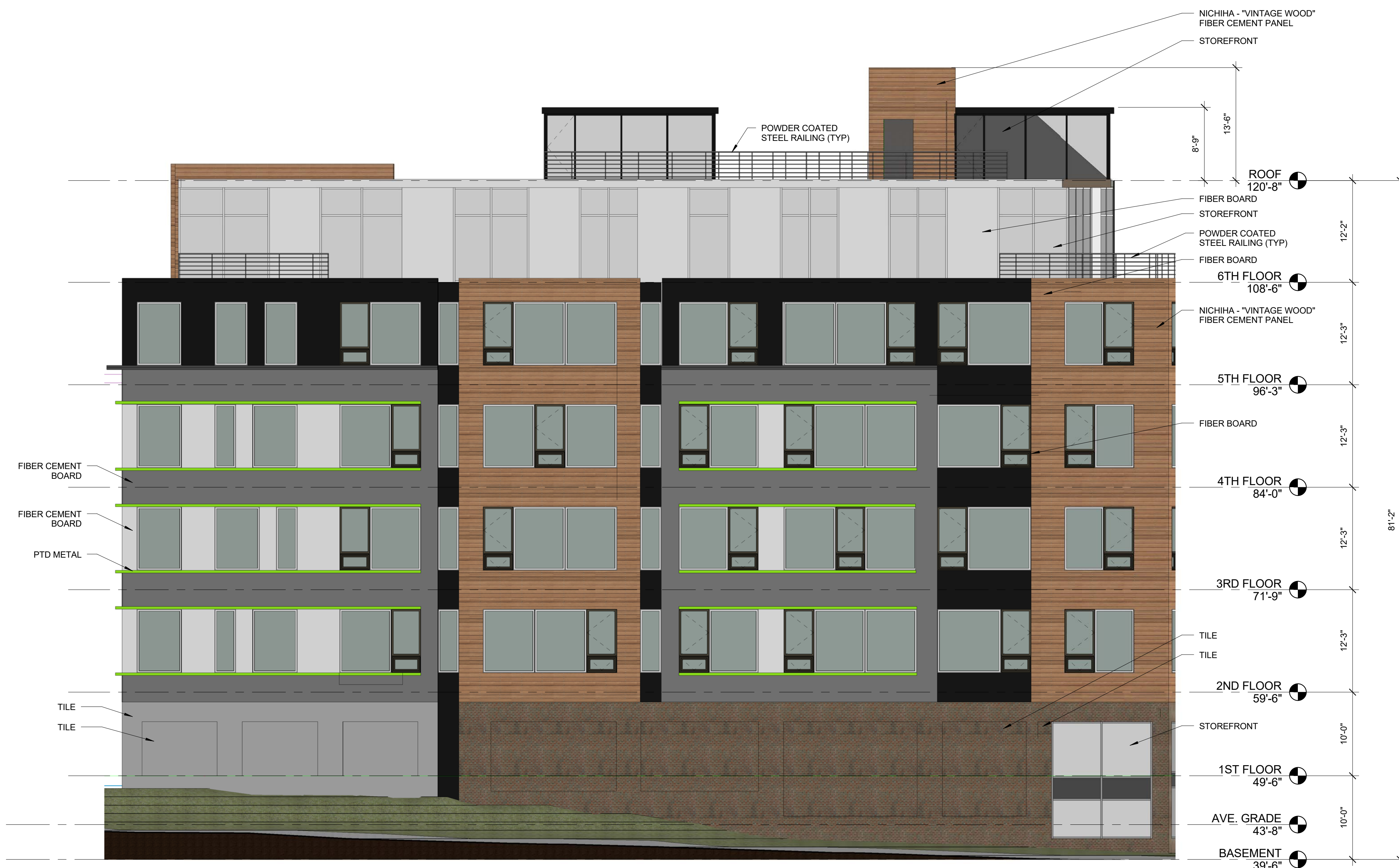
1 | FRANKLIN STREET ELEVATION 1/8" = 1'-0" 0 4'-0" 8'-0" 16'-0" 32'-0"