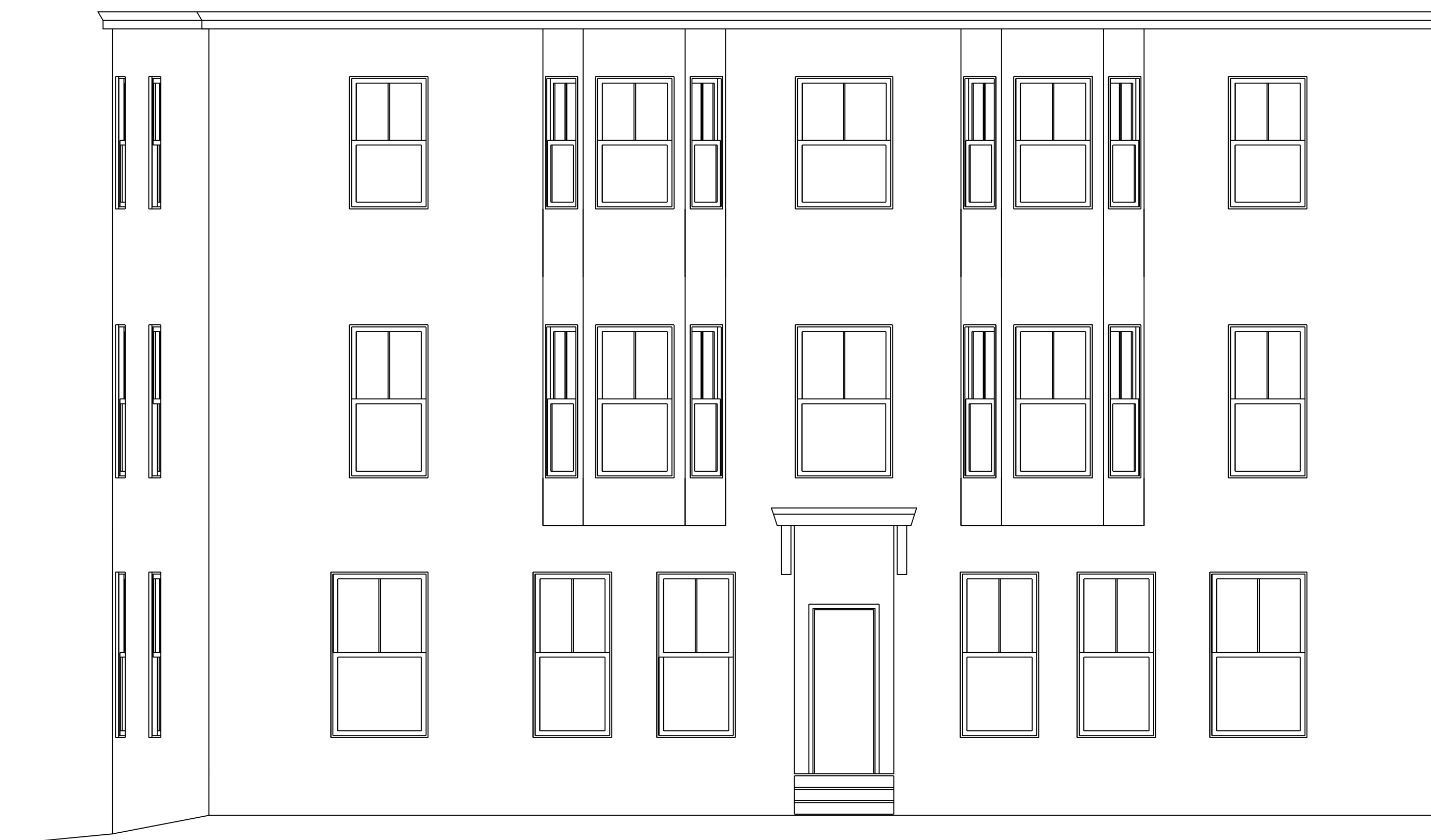
1 NORTH WEST ELEVATION 1/4" = 1'-0"