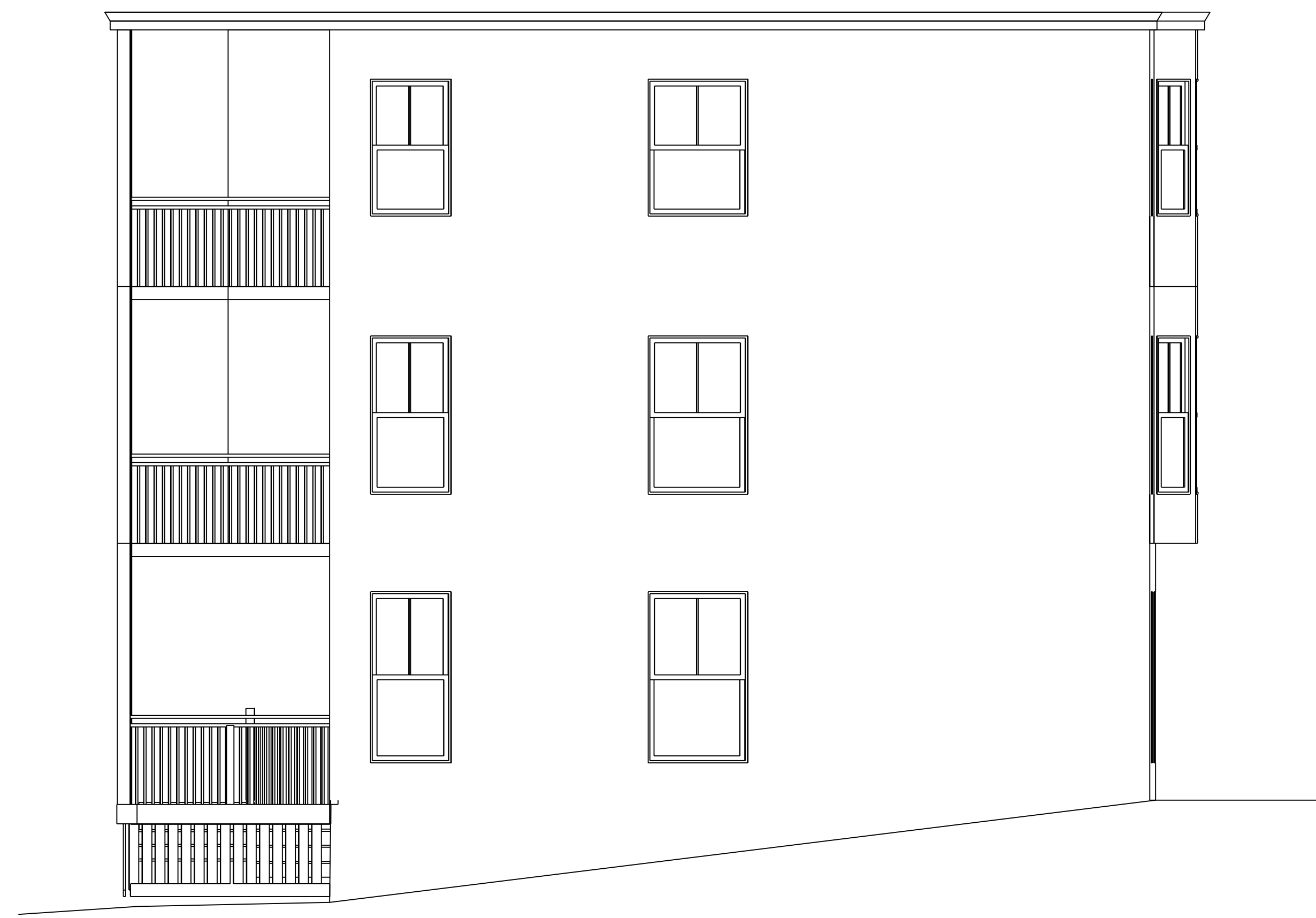
2 NORTH EAST ELEVATION 1/4" = 1'-0"