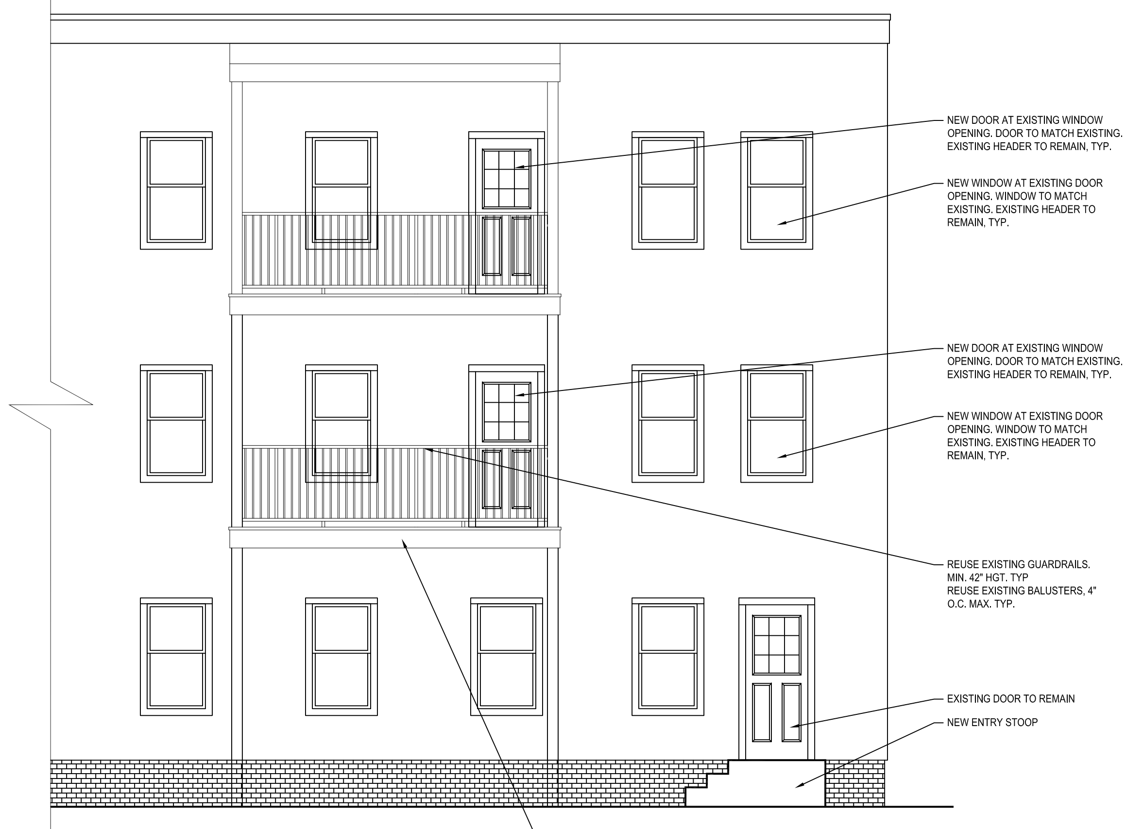
1 PROPOSED BUILDING ELEVATION SCALE: 1/4"=1'-0"