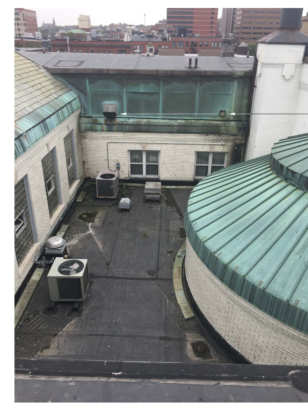
EXISTING VENT COURT ELEVATION NO SCALE