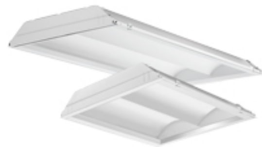
C LED VOLUMETRIC 2 x 4