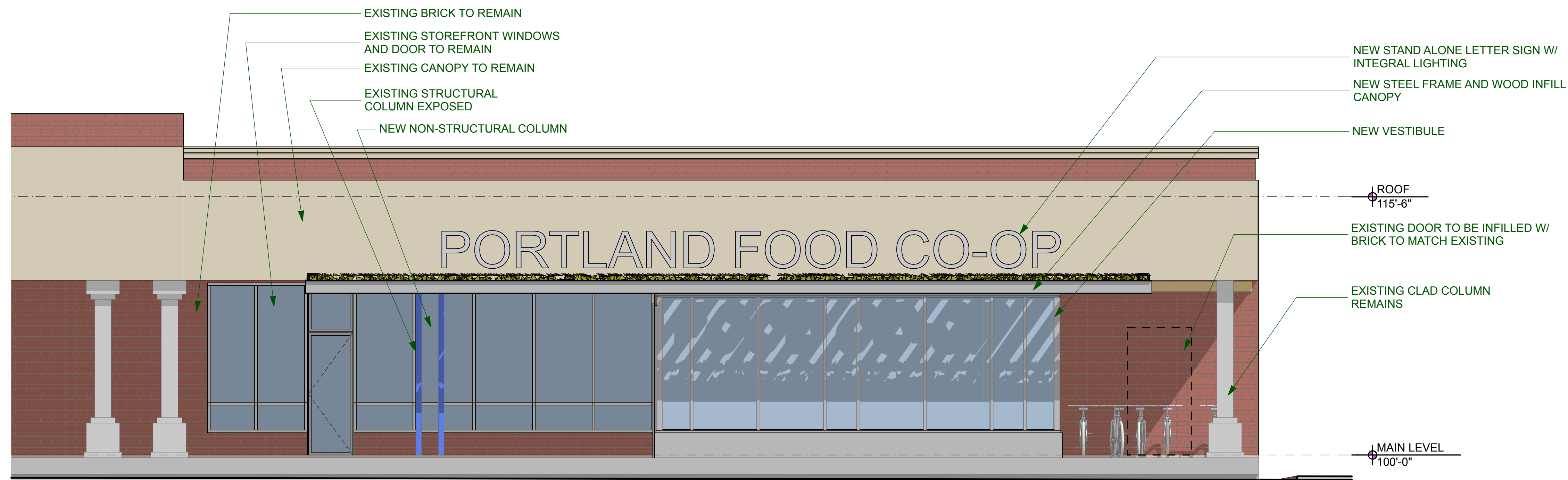
3 West Elevation SCALE: 1/4" = 1'-0"