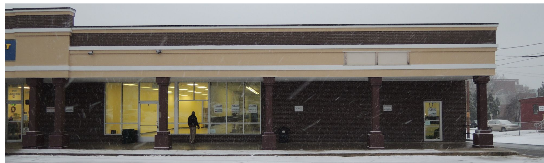
1 Existing SCALE: 1:1.11