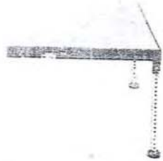
2' x 4' Deck Section

Standard on all decks is the original cam lock feature which firmly fastens stage sections together from the top of the stage platform. Cam lock holes are neatly plugged with a cap to fill the surface.